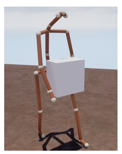
Figure 2: A 3D Avatar replaying the captured gesture, here, lifting a load.

and inputted in the clustering process by adjusting the aforementioned two parameters to reach K. For each cluster, the resulting centroid will be the generated observation point location. This specific position and the data set of its belonging cluster are sent to the next clustering.