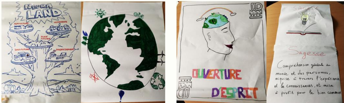
Fig. 1 Examples of student creative productions. On the left, module 4 (utopia). On the right, module 7 (value cards).

Regarding the content, the modules are introduced with mythical narratives, literary and historical references with strong symbolism, to question the engineering profession, its potentials, and its risks. Group exercises seek to deepen this emotional work, engaging the creativity of the students. It is also an opportunity for them to engage in activities that are rarely present in their usual curriculum, such as drawing or theatrical performance. In particular, the modules on utopia (module 4), values (module 6-7) and engineer's oath (module 8) lead students to imagine the potential of their profession, as well as the possible contributions they can make, by giving free rein to their imagination. Examples of their creations are showed in Figure 1.