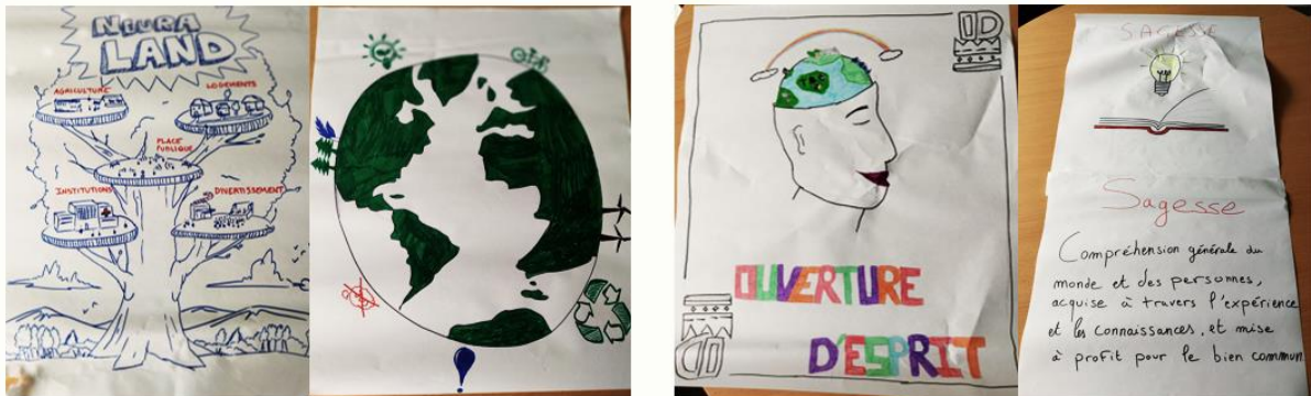
Fig. 1 Examples of student creative productions. On the left, module 4 (utopia). On the right, module 7 (value cards).

Regarding the content, the modules are introduced with mythical narratives, literary and historical references with strong symbolism, to question the engineering profession, its potentials, and its risks. Group exercises seek to deepen this emotional work, engaging the creativity of the students. It is also an opportunity for them to engage in activities that are rarely present in their usual curriculum, such as drawing or theatrical performance. In particular, the modules on utopia (module 4), values (module 6-7) and engineer's oath (module 8) lead students to imagine the potential of their profession, as well as the possible contributions they can make, by giving free rein to their imagination. Examples of their creations are showed in Figure 1.