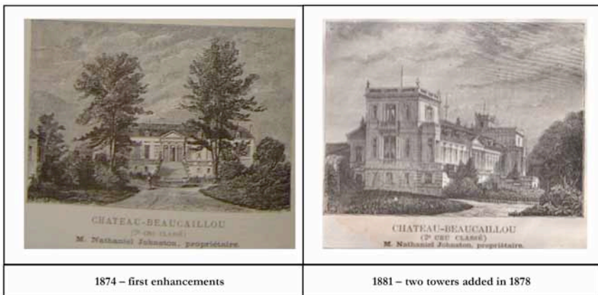
Fig. 2. The Enhancement of Château Ducru-Beaucaillou, Saint-Julien, Médoc.