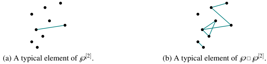
Figure 1: Construction of the species GR of simple graphs.

Let us denote \bar{n} = n(n+1) \cdots (n+p) . Using the formalism of virtual species, see [1] again for more details, we have the following corollary.