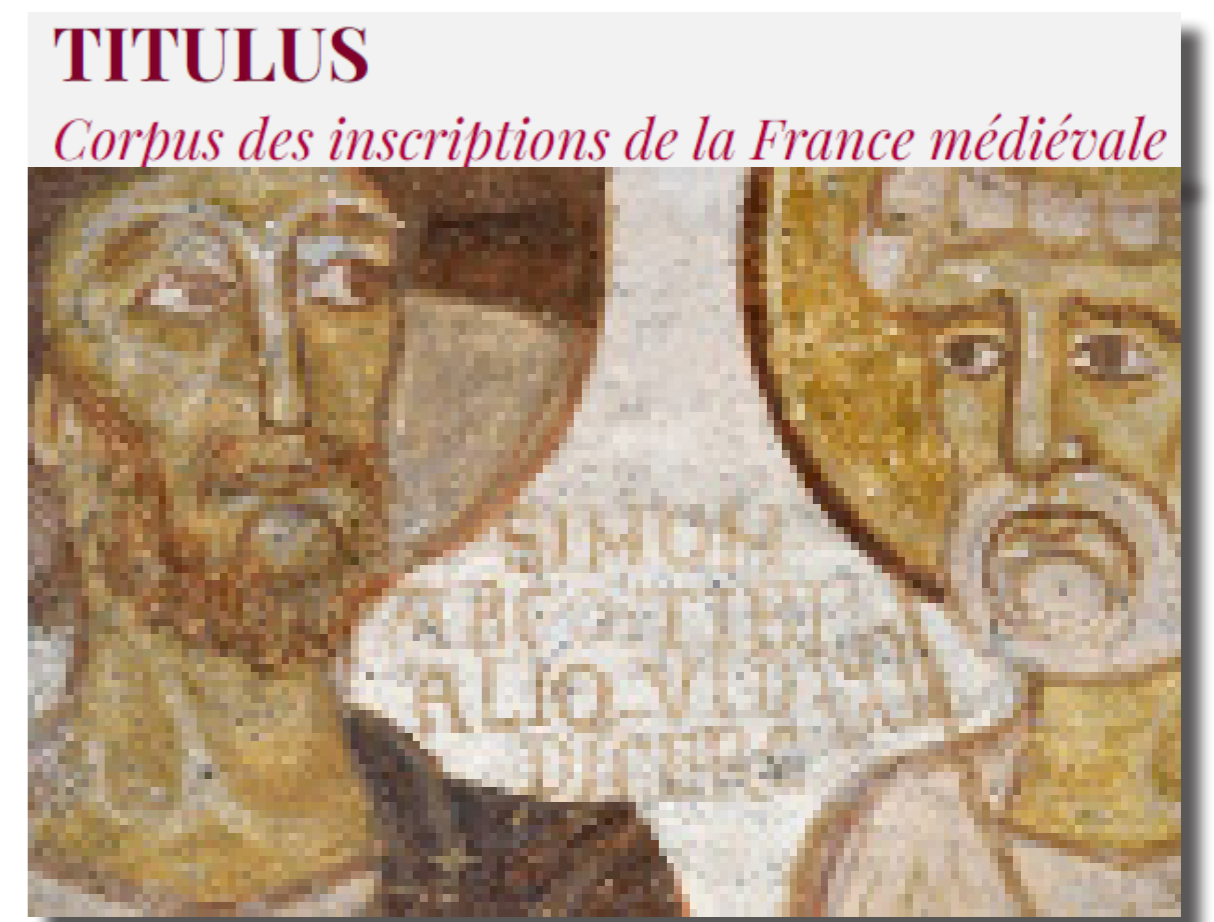
Two project members of the Cluster 5A :