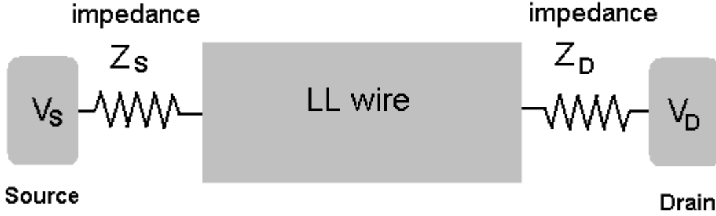
Fig. 1. Impedance boundary conditions: the LL wire is connected to two electrodes at voltages V_S and V_D through two impedances.

This introduces reflection coefficients for the density: