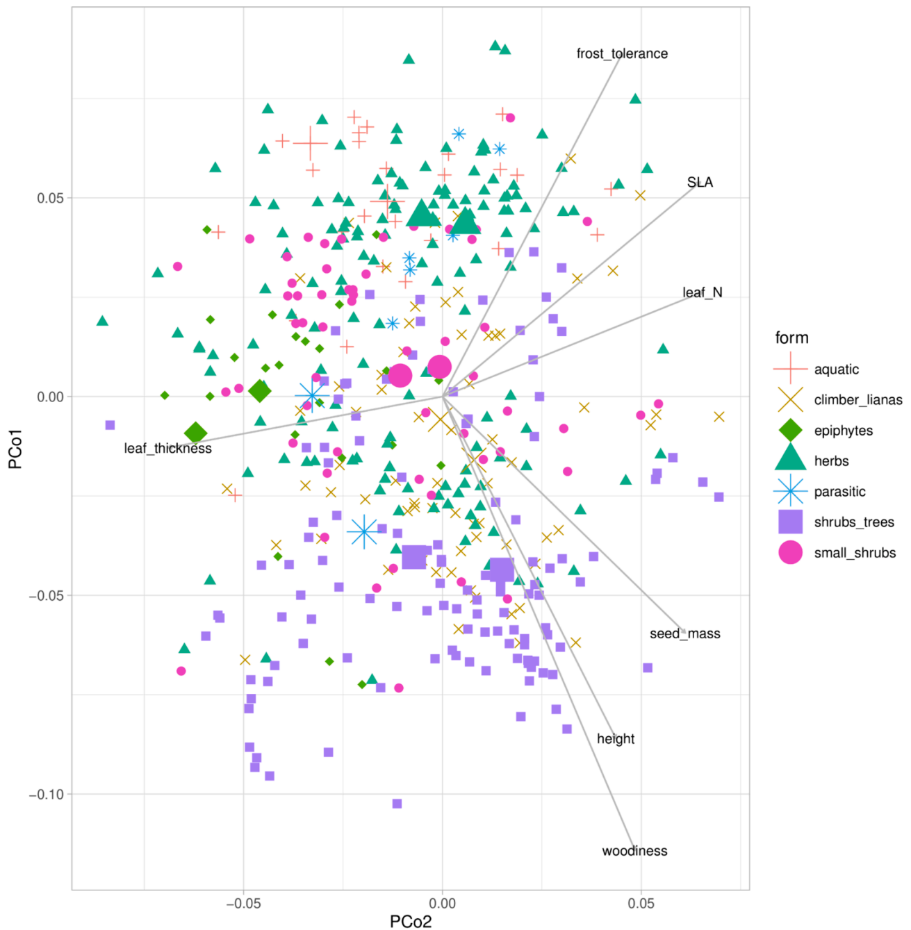
Fig. 2. Principal Coordinates Analysis (PCoA) of plant functional groups (PFGs) in the plant characteristics space (including functional traits and soil preferences), symbols are PFGs centroids. Arrows show the gradient of the seven fitted variables (traits) most correlated ( r^2 > |0.2| ) with the first two ordination axes: woodiness, frost tolerance, height, seed_mass, SLA, leaf_N, and leaf_thickness. Bigger symbols represent the two most species rich PFGs for each growth form. SLA=specific leaf area; leaf_N=leaf Nitrogen content.

the used trait data that were further propagated through the missing data imputation procedure.