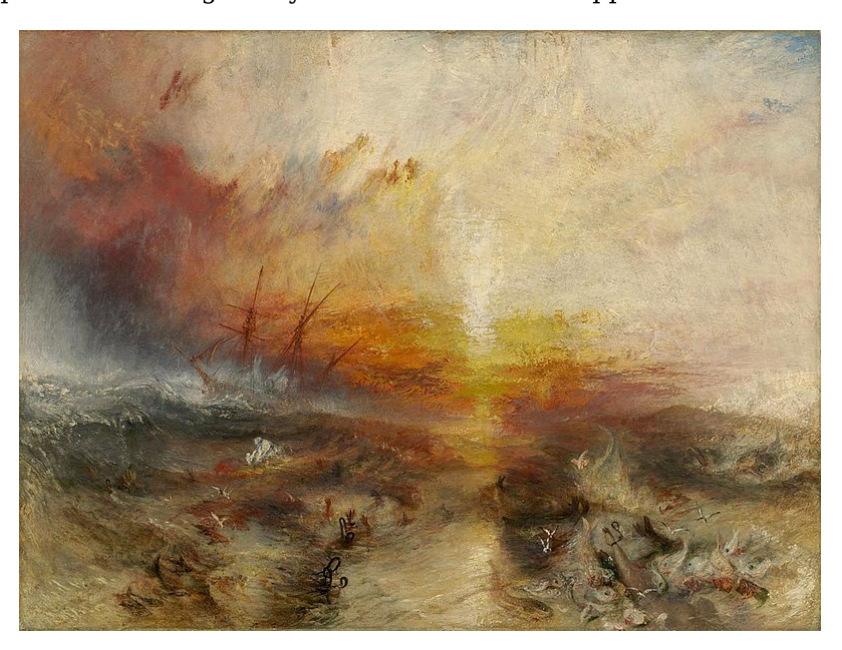
J.M.W. Turner, The Slave Ship , 1840. Oil on canvas. 90.8 x 122.6 cm.

(equally illusory) Fountain (1917/1964) of Marcel Duchamp. The playful allusion to Kanye West positions the struggling figure in the boat as the rapper himself, haphazardly navigating the shark-infested waters of contemporary white supremacy despite the seeming safety of his much-touted support for Donald Trump.