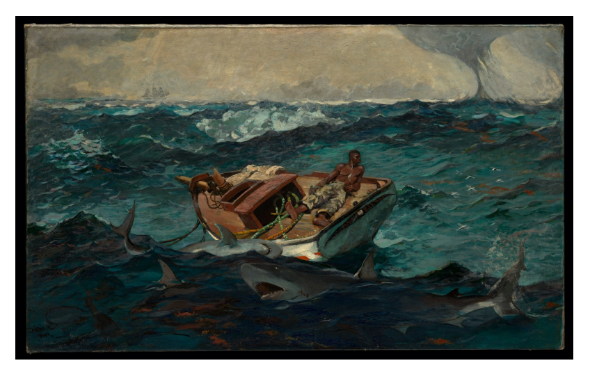
Winslow Homer, The Gulf Stream, 1899, reworked 1906. Oil on canvas. 71.4 x

Recipients placed in public space, On Elbows and The Gulf Stream (Hayden's version) were participatory artworks that encouraged visitors' thoughts on the forgotten hypocrisies hidden in the city infrastructure laid out before their eyes. Before the abolition of slavery in New York in 1827, the Brooklyn economy depended on slavery, a fact elided in favour of the memory of the Northern state's anti-slavery stance during the Civil War. Now a space for leisurely strolls and health-seeking joggers, the Brooklyn Bridge Park looks out onto Manhattan—where Wall Street was a slave trading market in Dutch colonial times—and warehouses of pier where the goods of slavery might have been stored. Hayden's The Gulf Stream urged reflection about ill-begotten urban wealth; his boat did not float in life-sheltering water but amidst a sterile pile of rubble, a shambolic contrast with the neat lines of the iconic Manhattan skyline opposite.