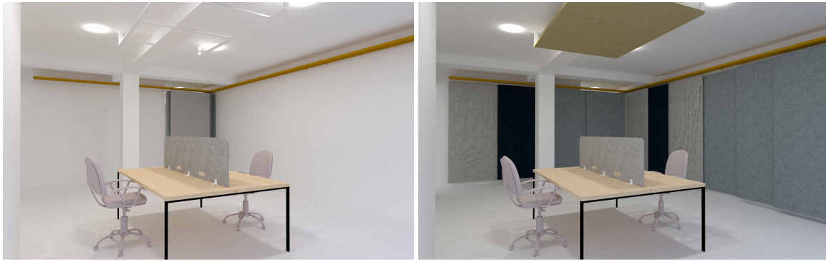
Figure 3: The LEB Acoustics Workshop in a resonant acoustics situation and with absorber panels. (Design Valentine Maupetit - Marie Simon-Thomas)