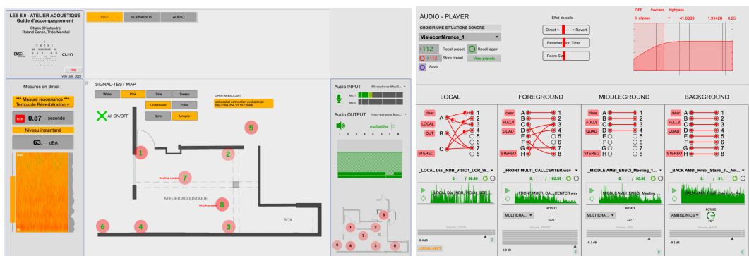
Figure 5: Sound situation simulator user interface

The device also includes real-time measurement tools that are continuously active, allowing for the objective assessment of situations and comparison with simple tools (see Figure 5). To ensure high-quality measurements integrated into the developed software application, we use a calibrated measurement microphone paired with a digital audio interface to enable the computer to receive the signal. The signal is then adjusted using a weighting filter to convert dB SPL into dBA and then an absolute correction is applied to align the level with that of a professional sound level meter. However, there is a margin of error of \pm 3 dB depending on the situation, which does not significantly affect the experience, as the measurements are taken relatively (for comparison purposes) rather than absolutely. The application then provides a continuous intensity measurement (in dBA) as well as a Laeq over a specified time period. Additionally, we’ve created a simple reverberation time measurement tool that assesses the ambient sound level and then measures the decay from an impulse. It’s important to note that this measurement tool is primarily useful for comparing situations (such as the deployment of devices, presence of specific furniture, empty spaces, etc.), as the variability of situations (position relative to the microphone, background noise level, spatial configuration) and sources (e.g., clap, burst, balloon, etc.) make it challenging to achieve laboratory-level measurements.