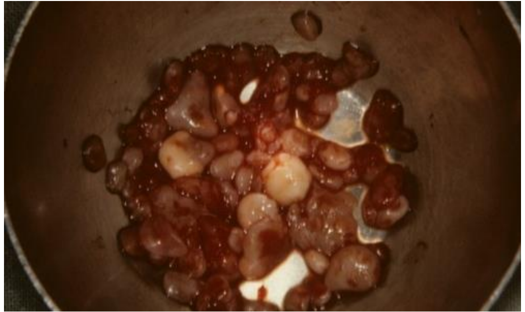
Figure 3. Intraoperative view of calcifications. Some calcified bodies are surrounded by synovial metaplasia.

Although diagnosis on the basis of clinical elements can be difficult and confusing with TMJ disorders, the therapeutic approach is, at present, widely proven. Open arthrotomy with removal of loose bodies is the gold standard in terms of treatment for this disease. Synovectomy, with or without condylotomy or condylectomy can be associated to this procedure if necessary [6]. Oral–facial rehabilitation, through physiotherapy and/or occlusal splint, should be conducted immediately after surgery to allow normalization of functions (chewing, oral opening). Even though CBCT or MRI facilitate the diagnosis of SC, the surgery by enabling histopathological analysis of the removed bodies is essential to confirm the diagnosis [14].