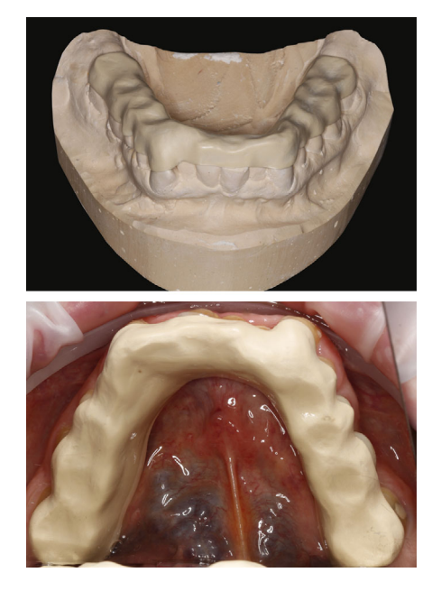
FIGURE 2 Photographs of the PEEK occlusal splint on the plaster cast (upper) and when placed in mouth (lower). It clearly appears that the PEEK splint is much more visible than one in transparent resin

Its mechanical properties are even more interesting because in its natural state, that is, when it is not modified, PEEK shows a behavior close to natural hard tissue such as cortical bone and dentin.<sup>20</sup> With an elastic modulus close to 3.5-4GPa according to the majority of the studies,<sup>9</sup> strength transmission to natural tissues can be envisaged without harmful effects. Indeed, the use of materials (either metallic or ceramic) with mechanical properties far removed from living tissue can lead to pathogenic effects, such as stress shielding.<sup>21</sup> The reinforced versions of PEEK increase the elasticity modulus to a level close to that of cortical bone. This is especially true when the