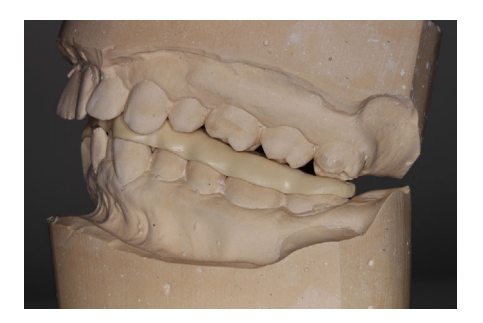
FIGURE 3 The high mechanical resistance of PEEK material enables to adapt its thickness in a patient with difficult occlusal context

(2 mm) were based on the one in resin that the patient was already wearing because it helped relieve her joint problems.