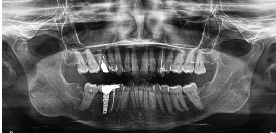
FIGURE 1 Panoramic X-ray of the patient performed during her first consultation in our dental unit

The patient's dental history included caries treatments in adolescence on teeth #16 and #46 which were treated endodontically, as were #24 and #35 later (Figure 1). The #16 has since undergone apical resection due to the presence of a periapical granuloma. The tooth #46 was extracted in the 2000's and replaced with an implant. Composite resins, of different ages due to their different radiolucency, are present on the maxillary incisors.