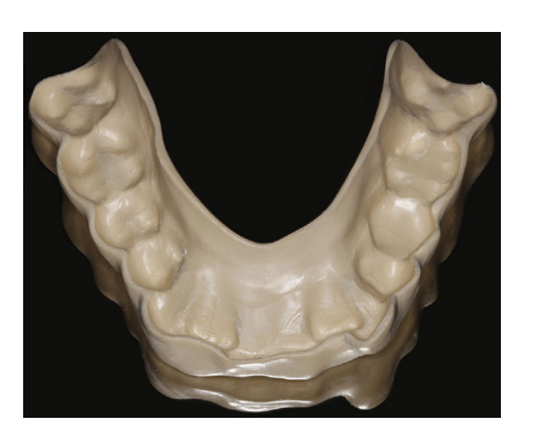
FIGURE 4 The lingual side of the splint is particularly deep in order to stabilize the structure

material is modified by carbon or hydroxyapatite adjunction for example.<sup>19</sup>