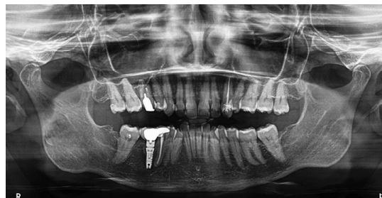
FIGURE 1 Panoramic X-ray of the patient performed during her first consultation in our dental unit

The splint was initially prescribed to compensate for the absence of a meniscus in the left temporomandibular joint, which, together with the patient's recurrent cervical hernias, caused significant chronic pain. The absence of the meniscus was detected by magnetic resonance imaging in 2005 and has obviously not changed since. Regardless of the mucosal signs triggered by wearing the splint, its adjustment in a myo-centric position with an average thickness of 2 mm has always helped the woman to relieve her joint pain.