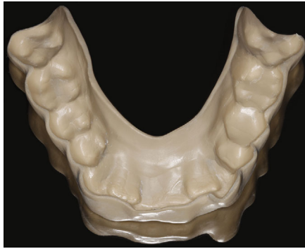
FIGURE 4 The lingual side of the splint is particularly deep in order to stabilize the structure

material is modified by carbon or hydroxyapatite adjunction for example. 19