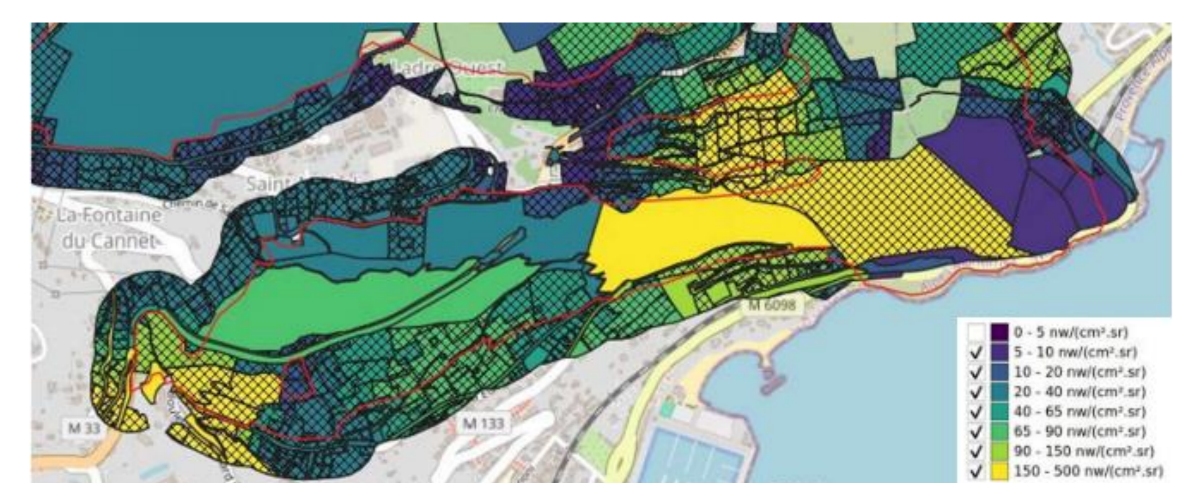
Brightest parcels over the biodiversity hot spot of Cap Roux (French Riviera). Private parcels are hatched. Biodiversity hot spots are in red.

These data can be used to... • Distinguishing private from public lighting, when a public light database is available • Build a « black corridor » diagnosis of an area • Identifying problematic areas, where a dense biodiversity coexists with a strong ALAN To go further... For studies over smaller areas, high resolution and up-to-date night-time satellite data are also available (Jilin or SDGSAT-1), under conditions.