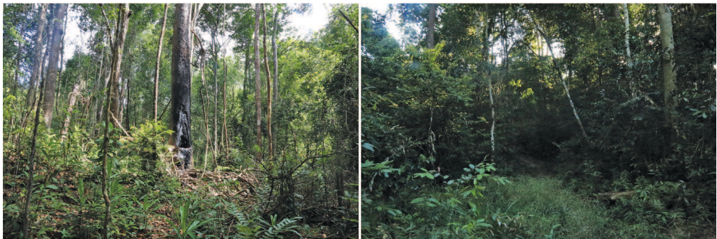
Fig. 6. – Kampong Thom province, Prey Kbal Ou Kror Nhak: type locality of Ceratoderus maruyamai Cabon, n. sp. (Photos taken by Mr. Seiha Hun).

Biology. – The two specimens were collected at the same time in a forest with grass and shrubs (fig. 6) using a sweep net. The host is, therefore, unknown.