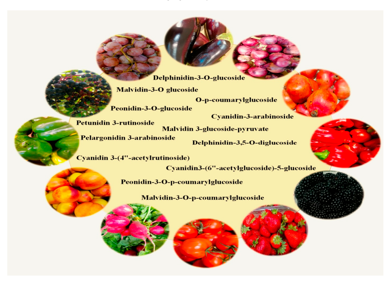
Figure 1. Natural anthocyanins and their sources in the diet.

supportive effect on some neurodegenerative diseases, which is particularly important in the context of an aging society [29–33].