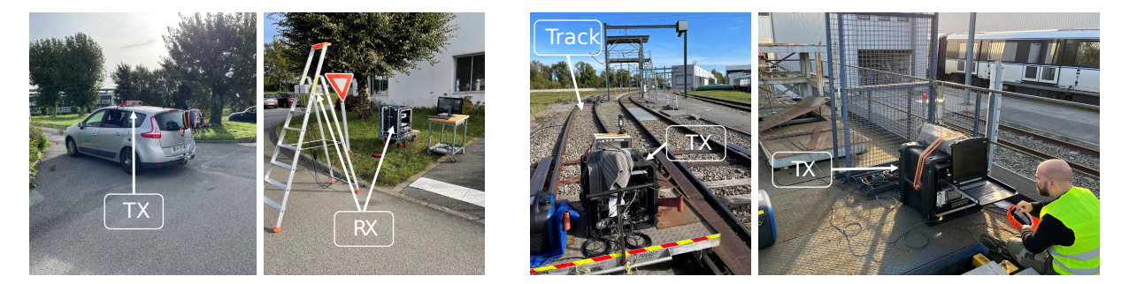
Figure 1. Setup in two different environments.

For this purpose, a Single Input Multiple Output (SIMO) Software Radio Defined (SDR) channel sounder has been developed. The architecture is based on Analog Device up and down converter from base band to 60 GHz. This SIMO channel sounder is an upgrade of the SISO sounder presented in [4]. The bandwidth has been increased to reach 180 MHz. To reduce the Power Amplitude to Peak Ration (PAPR), we use a multi-tone signal with Newman phases. The figure 1 shows different installation of the channel sounder. Moreover, the measurement duration is increasing by spatially sampling the channel.