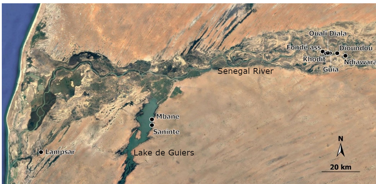
Fig. 1 Satellite map of the studied area in Northern Senegal. This map indicates the location of the nine targeted sites (black dots) and the name of the nearby nine villages associated to these Schistosoma haematobium transmission sites

The transmission sites close to the villages of Ndiawara ( 16^{\circ}35'04''\text{N} / 14^{\circ}50'58''\text{W} ), Ouali Diala ( 16^{\circ}35'56''\text{N} / 14^{\circ}56'10''\text{W} ), Dioundou ( 16^{\circ}35'50''\text{N} / 14^{\circ}53'22''\text{W} ), Fonde Ass ( 16^{\circ}36'20''\text{N} / 14^{\circ}57'38''\text{W} ) and Khodit