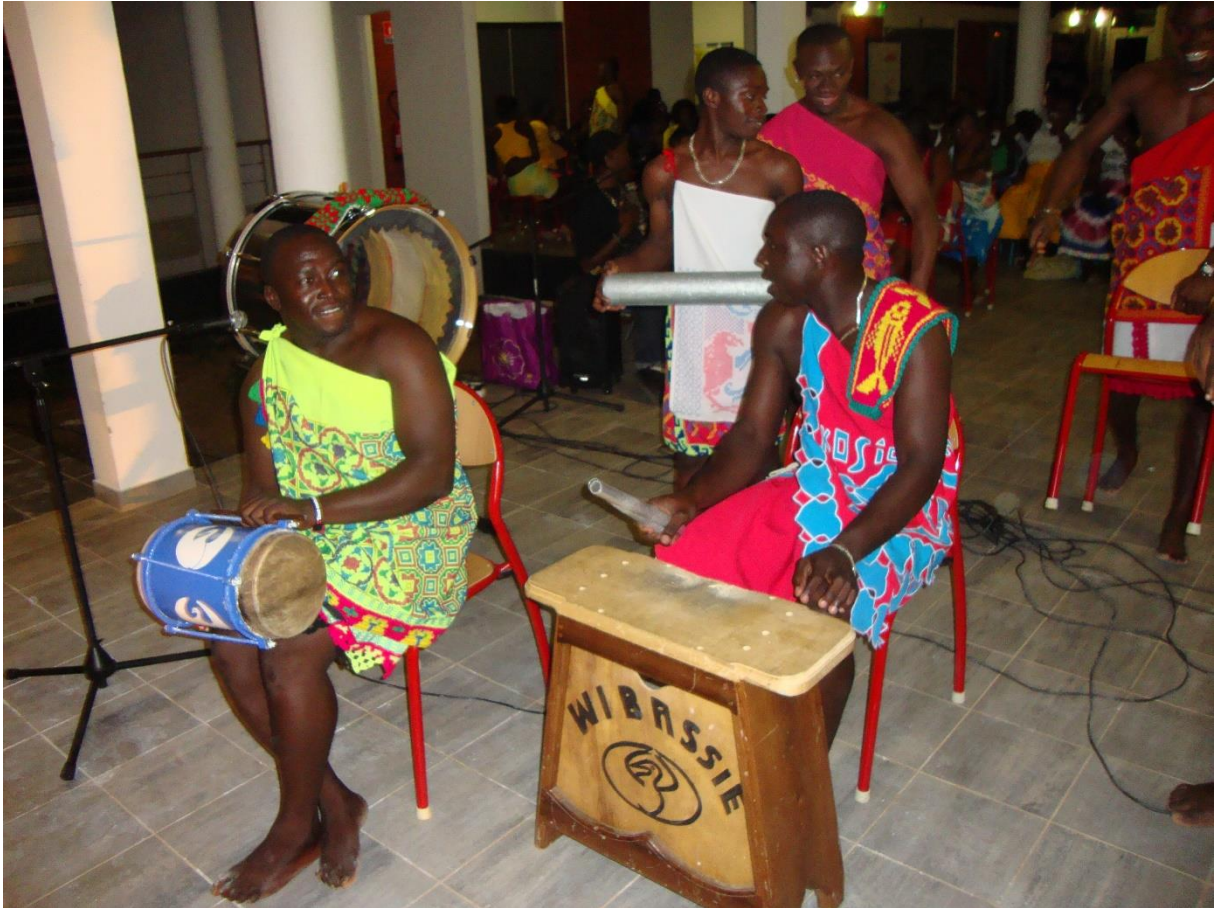
8. Haïma, tibwa et chacha for kawina music

By their sizes, their properties and their uses, French Guianese instruments also mark the heterogeneity and acoustic thickness, which can be defined by some musical types realised through two major worlds: the ritual musical worlds and the non-ritual. The resulting music playing is as much of a symbol as a phenomenon illuminating various social factors. These can be of all kinds of relations. It can be exchanging relations, communications, socio-cultural and artistic ties, but also cooperation, opposition or harmony, as well as social interactions that individuals or groups maintain. Here, the music playing is sometimes the substitution of the word, which underlies the foundation of various forms of representations and of communication encoded by music. Music playing participates in all kinds of harmony or even of "fusion of horizons", to quote Hans-Georg Gadamer (1967). All these actions are based on three major acts: see, hear and do, that form the basis of the significations arising from the performance and the musical act of the French Guianese musical cultures.