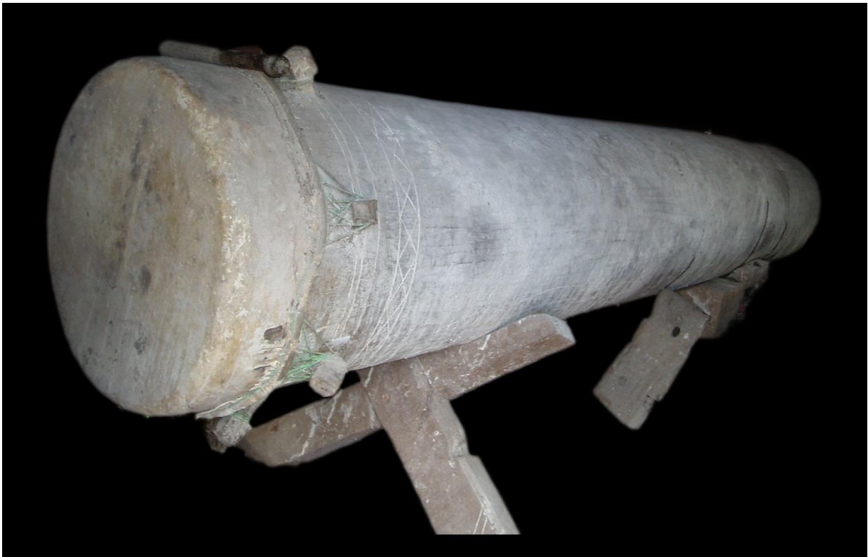
5. Sacred drum agida, Boni (Bushinengé)