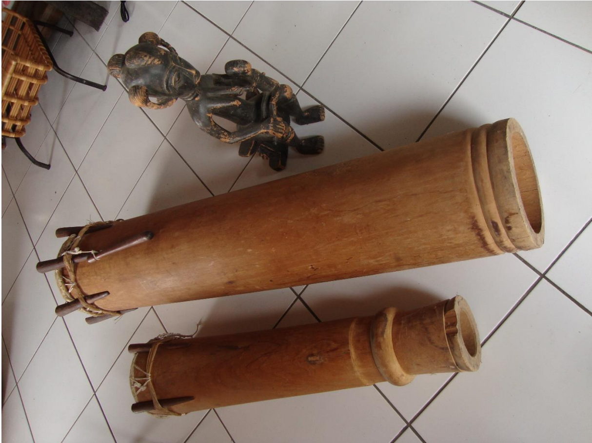
6. Gaa doon, Maa doon (male & female saramaca's sacred drum; Bushinengé)

This is the reason why, to understand and elucidate the functioning of the performances of the music of French Guiana, it is necessary to observe, interpret and define multiple musical and extra-musical relations and interrelations, as well as the resulting interactions. These relations mainly concern the musical relationships of the sound objects, of the musical instruments and their acoustic, of the playing techniques, of the formal and stylistic structuring, and finally of the genres and the repertoires. In addition, they concern the extra-musical relationships associated with them. These extra-musical relationships can involve the stakeholders or the persons of the society who produce them, the socio-cultural and even natural environments where they are produced, not to mention the circumstances, representations, and contexts associated with them, and many more other factors.