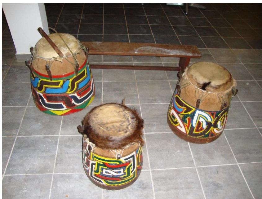
10. Gaan doon, pikin doon, tun & kwakwa