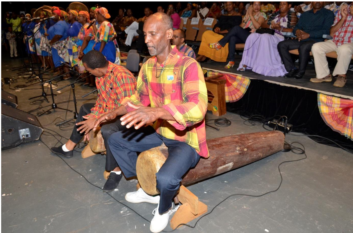
4a. Performance dance Kanmongwé dance performance, Yangwé drums of Creoles

While we are on the subject, Creoles and Bushinengé people, like for traditionalist Africans, for example, have a musical conception that comprises a double signification, technical and symbolic, through which, among others, musical instruments are raised to the rank of beings who "speak" or "sing" and beings who "support" or "accompany". This is the reason why the author calls these instruments "cultural beings". This consideration allows establishing a relationship between these personified instruments and the characters of the society, and even those of the spiritual sphere. Indeed, some of these instruments are truly considered male and female beings. Others are considered as ancestors or deities. The Creole pair of drums yangwé , for example, forms a male and female instrumental couple. As for the Boni agida drums, equivalent to the maa and gaan doon of the Saamaka, they are male and female, and their nature is sacred. Hence their sound is akin to the "voice" of deities or ancestors, depending on the destination of the concerned instrument.