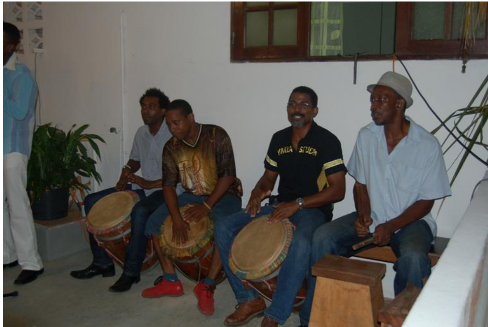
11a. Kaséko's orchestra