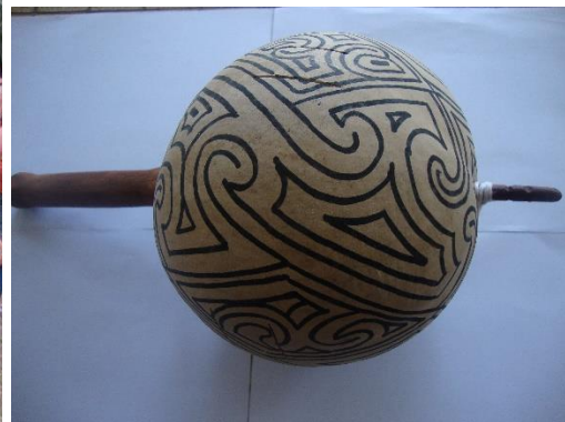
2. Shaman's malaka (Kali'na) Malaka