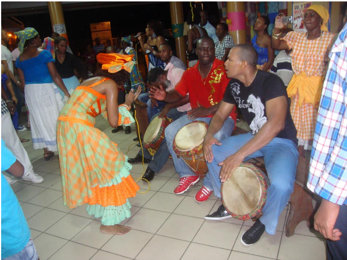
11b. Kaseko dance performance