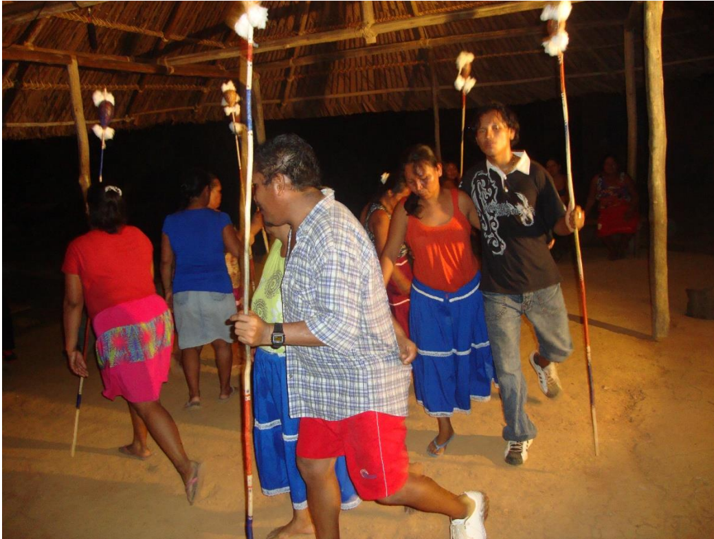
3. Performance Malaka's performance of Palikwene (Palikur)

In Bushinengé, the generic term apinti refers to the single membrane drum and to the ritual drum language ( apinti tongo ) it produces. It can designate the ritual as well and the musical practice that result from it.