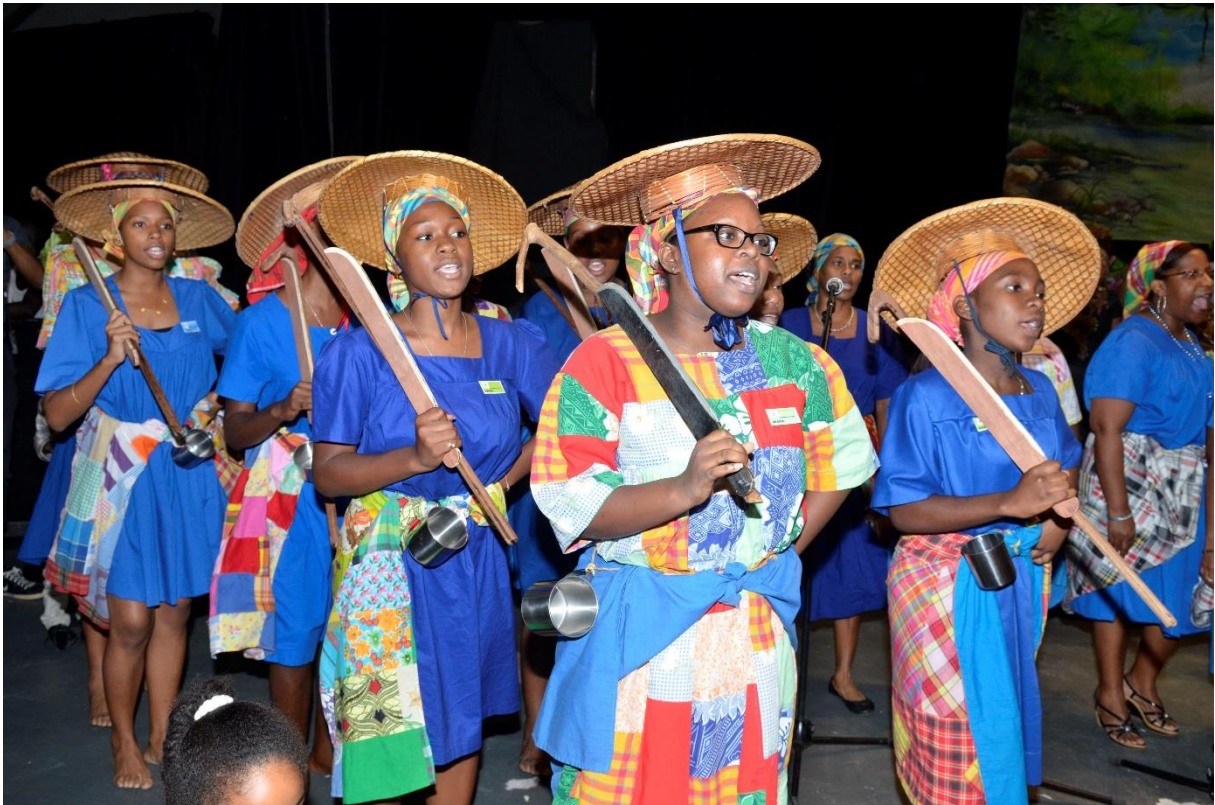
4b. Performance danse kanmongwé