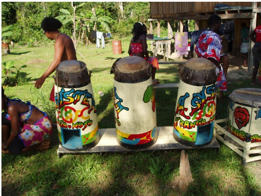
7. Aleke drums

For the rest, and in a general way, the variations of intensity or the use of shades are never explicit. They are often the result of a change of instrumentalist during the playing, each of them having a different touch and a different instrumental playing than other musicians. But sometimes - as for the young Bushinengé in the way they play the aleké or the bigi poku or kawina , two types of entertainment music - musicians significantly slow down or accelerate their rhythm, which causes some pretty singular variations of intensity.