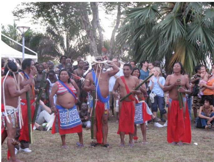
1. Tule dance performance

Thus, the word grajé , for instance, is a substantive that refers to the songs, the dance, the frame drums, the reference rhythm, the costumes and the musical performance, but also the food and other comings and doings that one can see at a musical evening of the same name ( grajé ), specifically among French Guianese Creoles. Another example: the Tule term used by the Wayãpi Amerindians refers to both music and its performance, and at the same time to the large bamboo single reed clarinets without finger holes, as well as the orchestral formation and the resulting musical repertoire. Additionally, for them, the substantive malaka can refer to the shamanic session, the songs and the dance, as well as the accompanying rattle. The music produced allows or facilitates communication with divine entities, among others. Finally, it also helps healing the sick persons. Therefore, overall, the malaka form cosmological propositions that the villagers agree with or discuss, as Jean-Michel Beudet (1997, 43) observed rightly.