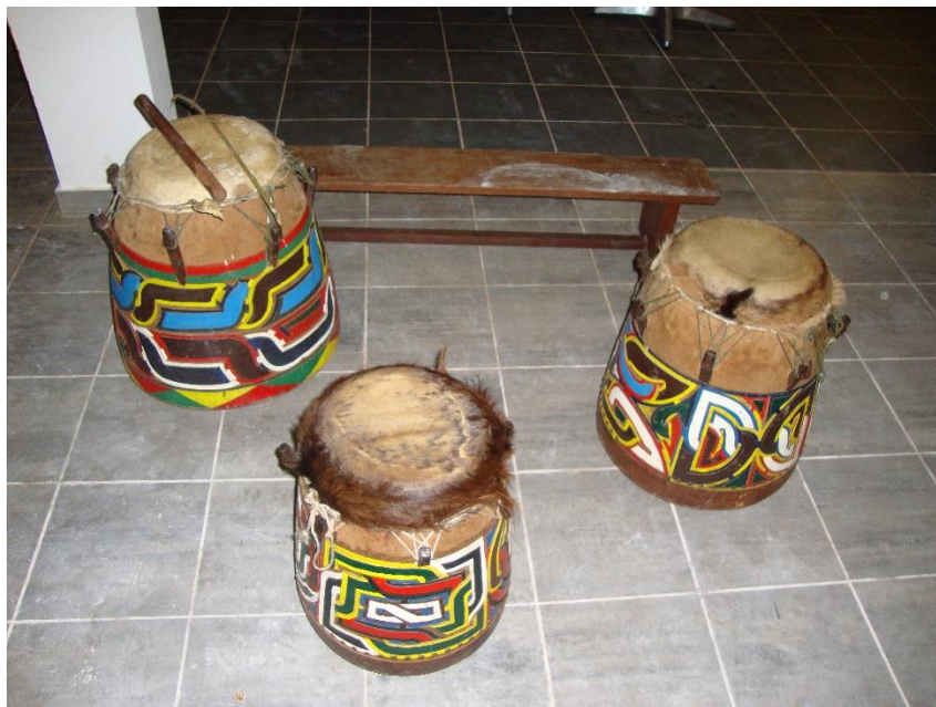
10. Gaan doon, pikin doon, tun & kwakwa