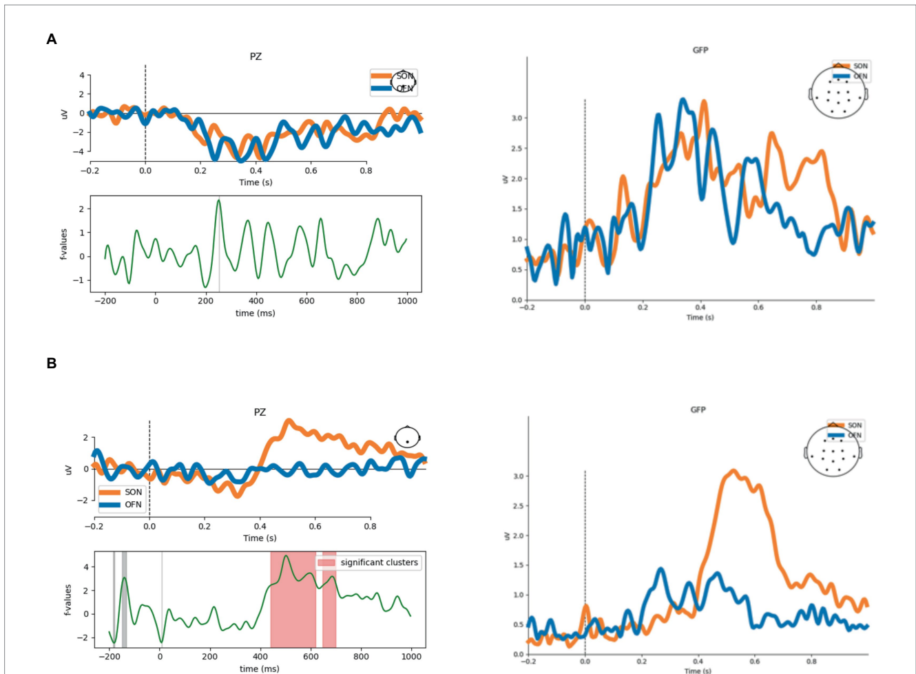
FIGURE 1 Illustrative cases. Event-related potentials (ERP) at Pz and global field power (GFP) from two patients are represented: one COMA patient without SON effect (A), and one COMA patient with SON effect (B). Temporal clustering permutation tests, with one sided t -tests and 10,000 permutations. Significance threshold: alpha cluster was set to 0.01; value of p \leq 0.05 for SON (orange curve) and OFN (blue curve) comparison at each sample. Abbreviations: SON=subject's own name; OFN=other first names.

and environmental processing and the complete absence of its behavioral signs, notably in the acute stage of coma and in UWS patients. In the early 2000s, functional neuroimaging studies suggested that cognitive processing capacity might be underestimated in MCS patients (Hirsch et al., 2001; Schiff et al., 2005). Based on our results, we assume that cortical brain activity that is dissociated from behavior is possible in patients with UWS (Edlow et al., 2017), but also in the acute stage of coma. The pattern of residual neural activity of a self-related stimulus perceptive discrimination we identified for the first time in such individuals suggest that EEG paradigms are required to complement behavioral assessment in patients without command following at the bedside (Kondziella et al., 2020). Definitely, behavior is an indirect and thus incomplete measure of brain functions leading to interpretative errors in these patients. Consequently, standardized clinical evaluation and neuroimaging-based measures (including bedside EEG-based techniques) should be integrated for multimodal evaluation of patients with DoC in accordance with the guidelines of the European and American Academies of Neurology on the diagnosis of coma and other DoC (Giacino et al., 2018; Kondziella et al., 2020).