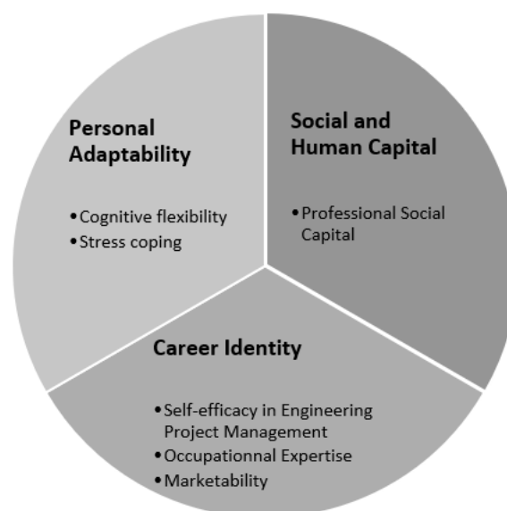
FIGURE 1. Synoptic diagram representing the competences framework

We summarize the conceptual framework and our research variables according to the following model (Figure 1):