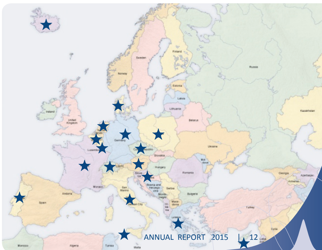
Figure 3: Members of the DARIAH-ERIC