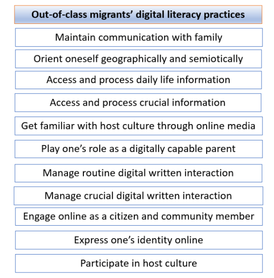
Figure 1. taxonomy of adult migrants' digital literacy

Figure 1 summarises the findings from the literature review and provides a tentative taxonomy of digital literacy. While not intended to be exhaustive or universally applicable, this taxonomy provides a list of the different literacy practices that can be developed informally across personal, social, and professional contexts by migrants and refugees, whether it is offline (using Google Map to find one's way in the host city) or online (e.g., consulting a government site to find official information on migration status). Literacy practices have been ordered according to (1) their perceived complexity and (2) the required level of engagement within the host culture.