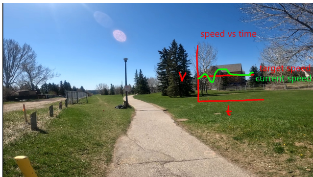
Figure 4: An early-stage sketch on top of a video snippet.

data along with a timeline indicating when the videos were taken during the workout. We plan to continue refining and expanding its features to further support our research and development efforts.