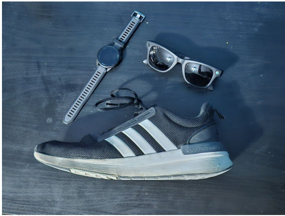
Figure 2: Our lightweight workout equipment for capturing runs, information needs, and biometric data: a Ray-Ban Meta Smart Glasses and a Garmin smartwatch.

Physical activities in dynamic outdoor scenarios have gained a lot of traction in the visualization community. The research ranges from analyzing the data outside of its context [1, 13–17, 22, 24] to embedding visual representations into scenarios, such as swimming [26], table tennis [5, 6], soccer [19, 24], basketball [2, 4, 11, 12, 20], cycling [9], badminton [7, 10, 27], and tennis [18]. These works mainly focus on providing technologies and tools that support injecting visual representations into various scenarios.