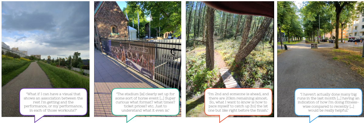
Figure 1: Four information needs, plus accompanying video stills captured during real-world runs and races highlight opportunities for new egocentric visualizations.