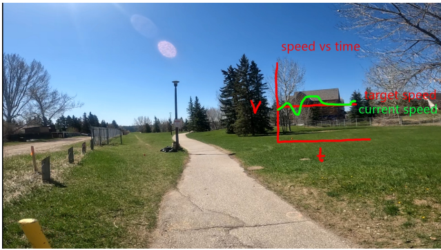
Figure 4: An early-stage sketch on top of a video snippet.

data along with a timeline indicating when the videos were taken during the workout. We plan to continue refining and expanding its features to further support our research and development efforts.