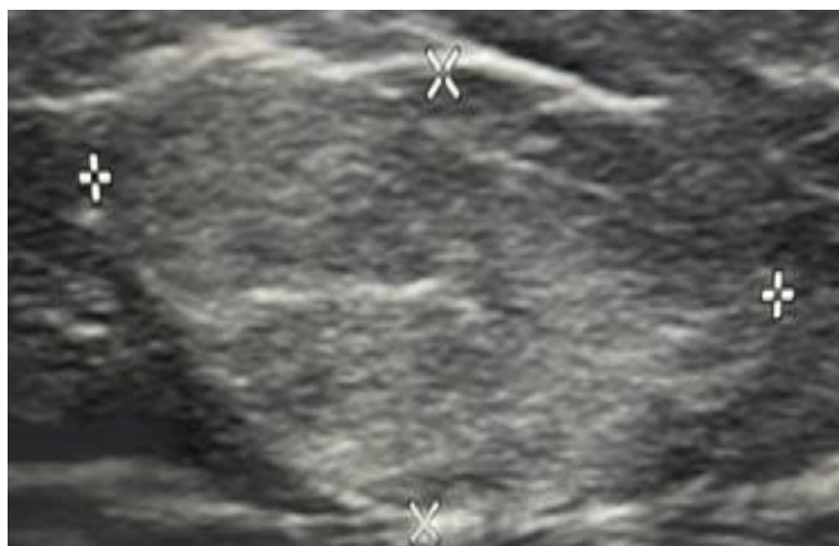
Fig. 5. Lipoma: Ultrasound appearance

Liposarcoma is mainly seen in middle-aged adults and clinically suspected in the case of a rapidly progressive tumor that invades local structures.[21]