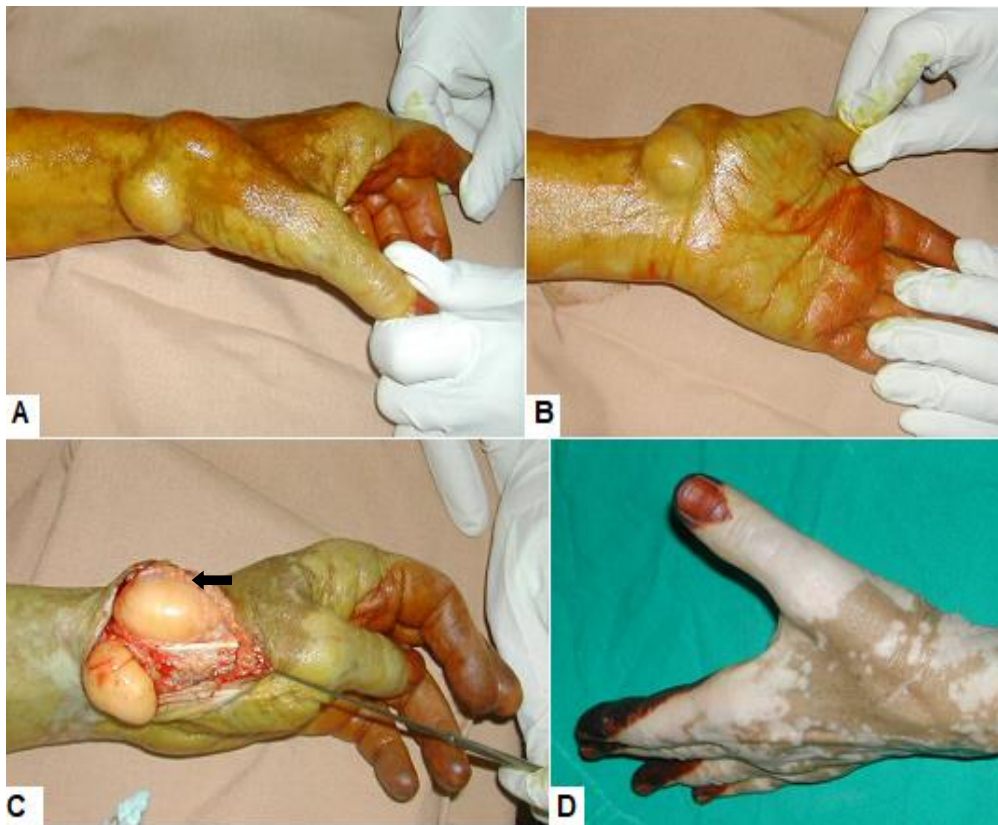
Fig. 1. A+B: Clinical presentation of a lipoma of the anatomical snuffbox C: Intraoperative findings: Lipoma Displacing the SBRN (Arrow). D: 3 months post operative

A 68-year-old male patient with no prior medical history presents with a swelling in the anatomical snuffbox of the left hand. Patient complains of paresthesia at the level of the first web space. Clinical examination reveals a soft and mobile tumor. Posch and Tinel's sign were positive. Ultrasound examination suggested a lipoma. Intraoperative findings showed a fatty tumor displacing the SBRN (Fig. 2). Histopathological examination confirmed a lipoma.