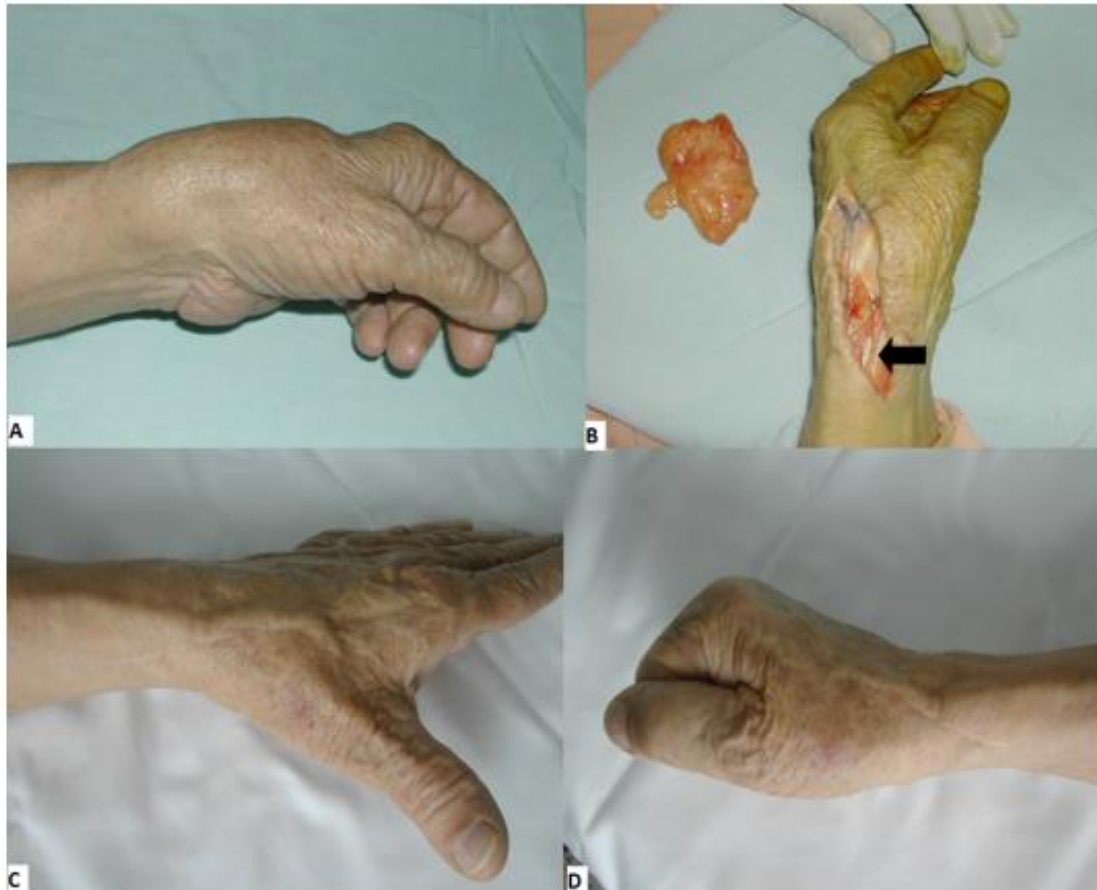
Fig. 2. A: Clinical presentation of a lipoma of the anatomical snuffbox. B: intraoperative findings: lipoma displacing the sbrn (arrow). C+D: 1 year post operative