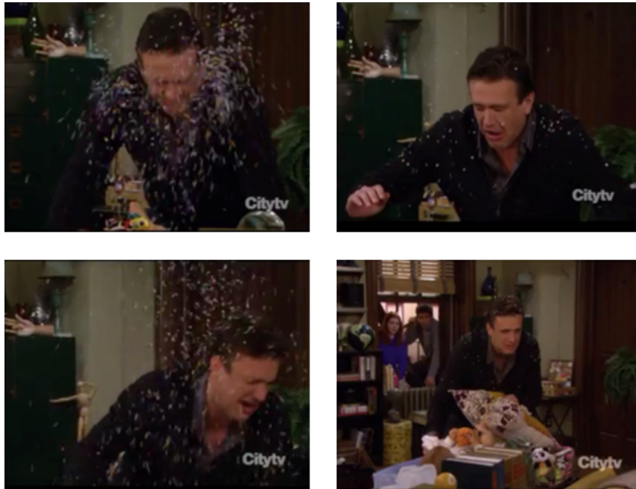
Fig. 1: FAECES conceptualised as CONFETTI (HIMYM 8x13)

Marshall is eating (“I’m eating chili, Lily”). Thanks to the metaphor, Lily strips the taboo from its negative overtones and hides the visual aspect of faeces to protect Marshall’s negative face and to avoid the verbal dysphemism (“that first big juicy, black...”). Later in the episode, as Marshall is changing baby Marvin, the same metaphor is re-used in a different mode: