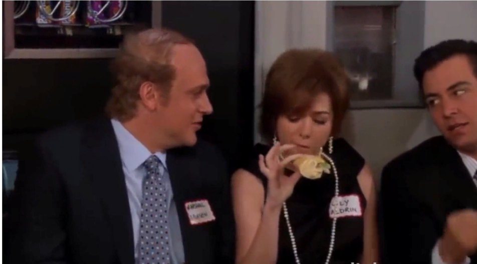
Fig. 6: Lily “eating a sandwich” ( HIMYM 3x05)

As in the majority of the occurrences analysed previously, humorousness in this episode partly relies on the novelty of the association of the two domains, which may be surprising to the viewers, and on the fact that saliency is reinforced by the multimodal representation of the source domain. However, the humorous dimension is strengthened by the recurrence of the metaphor throughout the series. In the episodes that follow this first mention (see Figure 7), the source domain is very often only visually represented by a sandwich, while the target domain is always represented metonymically, either through the EFFECT-FOR-CAUSE metonymy (which represents the characters under the influence of marijuana or through smoke in the room) or through a plastic bag that contains the sandwich. Sandwiches is substituted for marinated steak subs in one episode; the fact that it should start with the same phonemic sequence as marijuana (/ˈmæɪrɪ/) also participates in the humorous process.