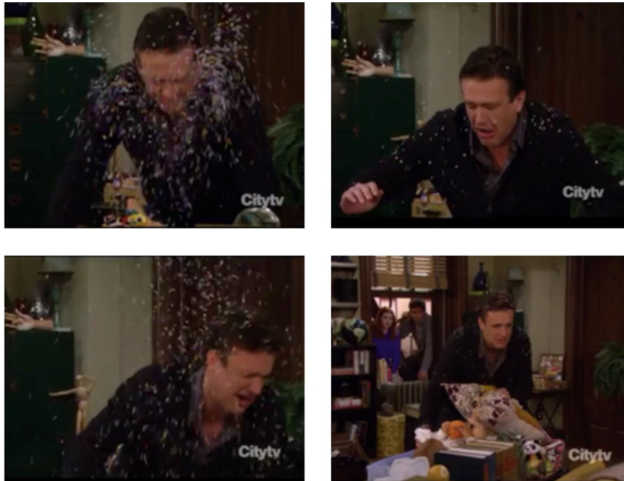
Fig. 1: FAECES conceptualised as CONFETTI (HIMYM 8x13)

Marshall is eating (“I’m eating chili, Lily”). Thanks to the metaphor, Lily strips the taboo from its negative overtones and hides the visual aspect of faeces to protect Marshall’s negative face and to avoid the verbal dysphemism (“that first big juicy, black...”). Later in the episode, as Marshall is changing baby Marvin, the same metaphor is re-used in a different mode: