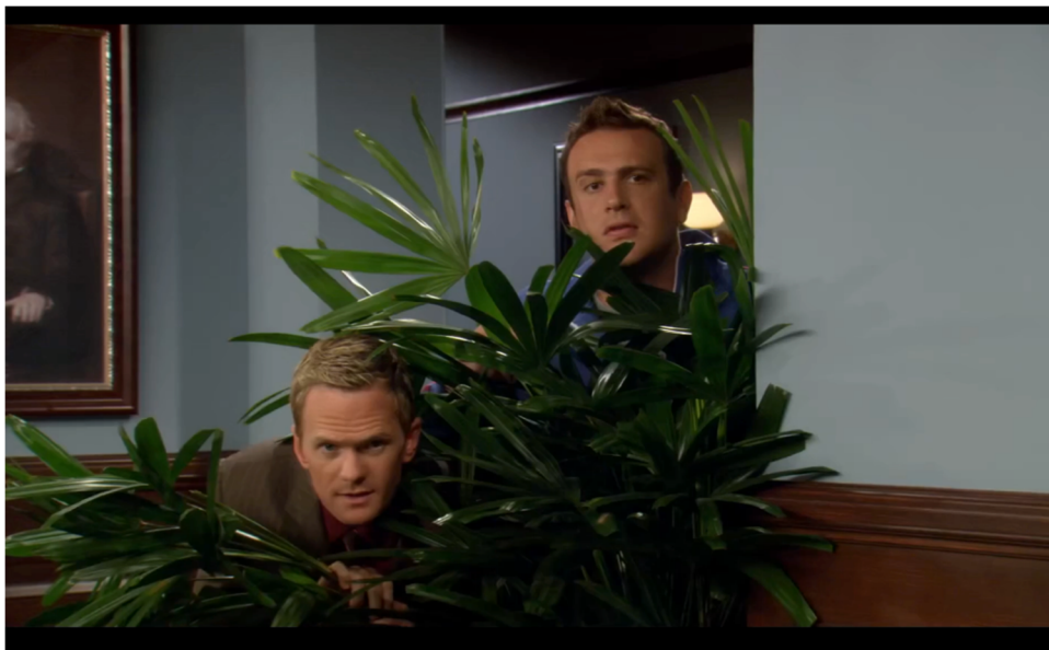
Fig. 4: Barney and Marshall hiding behind the potted plants ( HIMYM 2x06 )

The correspondences are explicit in this occurrence: the woman is a cougar, the nails are the claws, taking care of your physical appearance is camouflage, a home is a lair, other women are rival females, seduction is hunting, and so on. Interestingly, younger men are conceptualised as both prey and hunters, which highlights the reciprocity in seduction. This example differs from the previous ones in several respects. Firstly, it relies on a semi-lexicalised metaphor in which the correspondences are much more precisely established and elaborated. Not