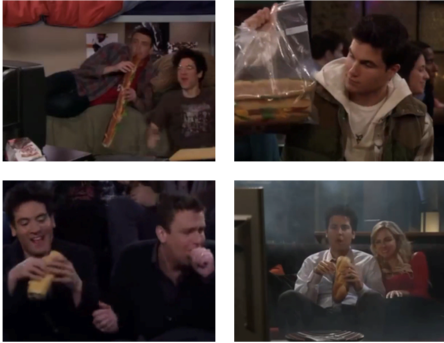
Fig. 7: "Eating a sandwich" in different episodes

These recurring allusions to HIMYM 3x05 throughout the series are rewarding for faithful viewers, who recognise the metaphor for what it is and enjoy the humorous effect of the repetition, all the more so as the sandwiches appear quite unexpectedly on the screen. The small variations (in the size of the sandwich, for example) also contribute to adding surprising elements and maintaining the humorous effect while minimising the weariness that may emerge by force of habit.