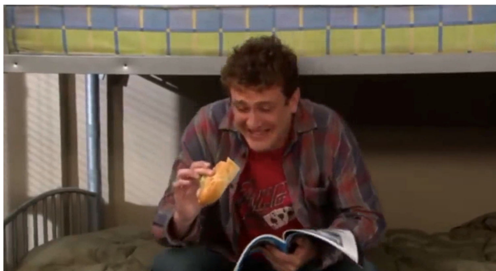
Fig. 5: Marshall "eating a sandwich" ( HIMYM 3x05 )

More specifically, in the visual mode, the sandwich replaces the joint and the target domain is metonymically represented by Marshall, who snorts with laughter and is blatantly under the influence of marijuana; this is a visual representation of the EFFECT-FOR-CAUSE metonymy (figure 5). This metaphor relies on experiential correlation between the domains of EATING and SMOKING, as they both involve carrying something to one's mouth with one's hand. The shape of the sandwich and the gestures used while eating it are evidently imported from the domain of SMOKING. There might also be some underlying metonymic motivation as the consumption of marijuana is known to promote the release of a hormone that stimulates hunger. The correspondences are quite easily identifiable: the joint is a sandwich, puffing is chewing, etc. In some respect, this occurrence is similar to the example analysed in 2.4 as the substitution is also a pretext for Ted's children not to be shocked but is actually a euphemistic dysphemism as there is no intention of sparing the viewers.