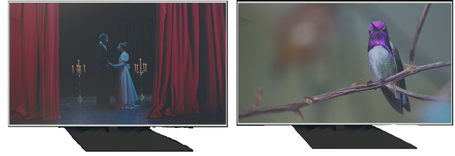
Figure 4: Two additional news reports that the participant sees during the simulation. The left screen shows the play rehearsal while the right screen shows the report on birds.