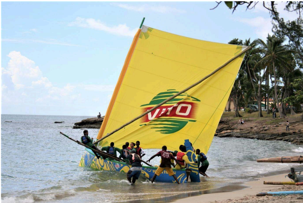
Photo 2. A traditional boat Yole at the start of a race for young people.