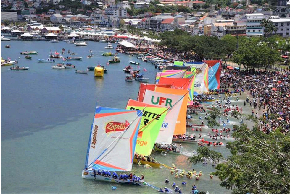
Photo 1. The start of the 2017 Tour des Yoles on the beach of Fort-de-France