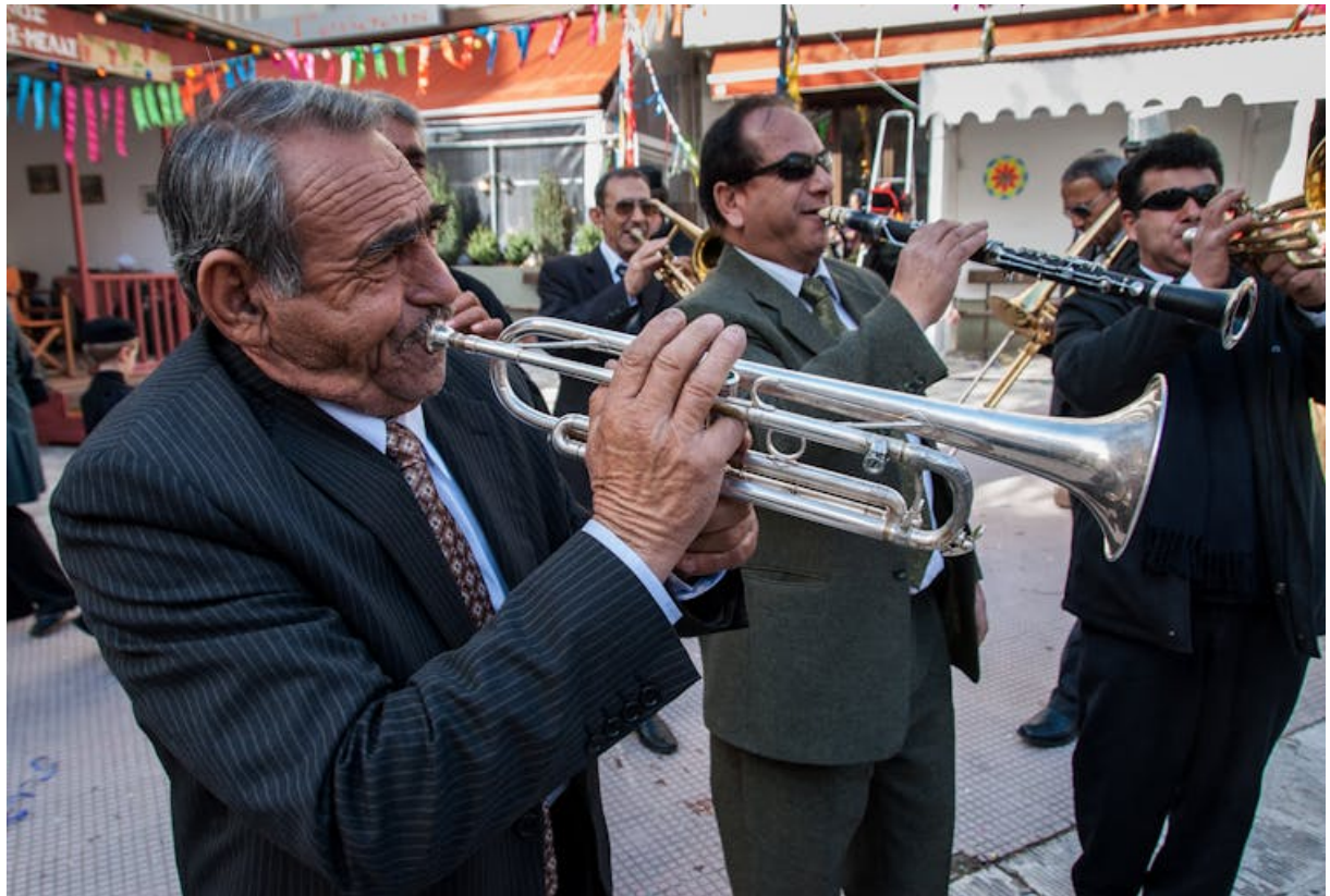
Romani trumpeteers in Greece. <u>dinosmichail</u> What kind of writings?

It is striking how almost all literary works by Gypsy writers include in their speeches the voice of the other, and their prejudices. Both educational and defensive, this allows the "gadzo", or non-Gypsy reader, to enter the work more easily.