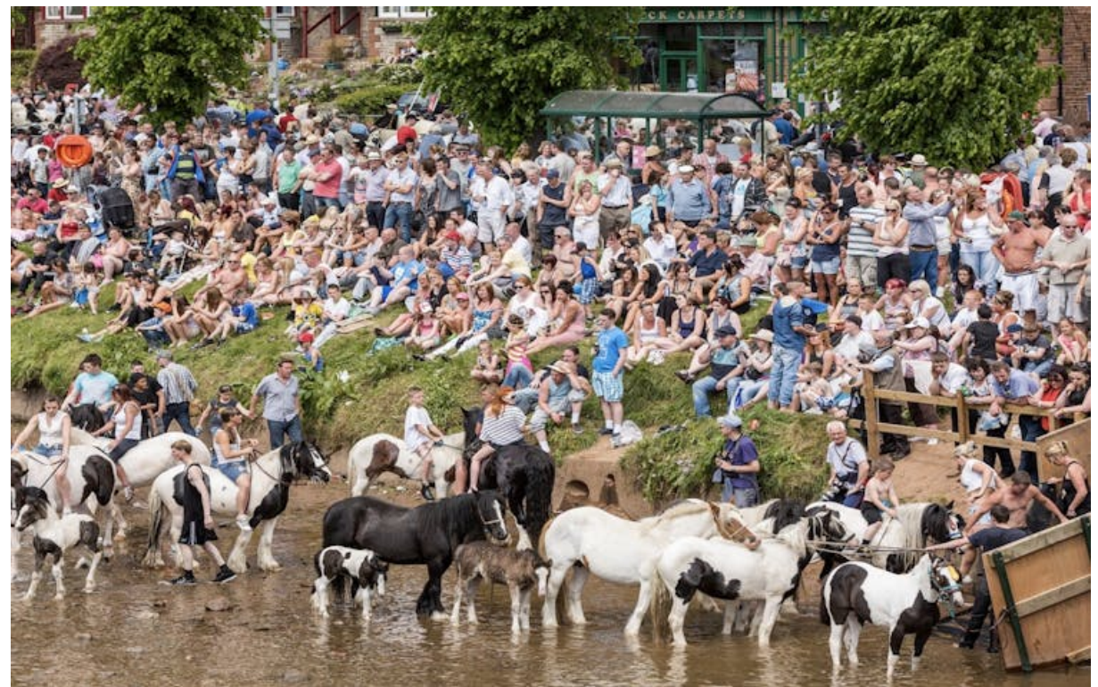
Appleby Horse Fair in Cumbria, north England, is one of the renowned meeting places for gypsies and travellers each year. Defining Romani writing

It can be difficult to define Gypsy literature. You can't place it in a specific geographic area. This makes it independent of national categories, and can create problems with the writing sometimes, since literature tends to invite the imagination of the reader to settle it in a particular space.