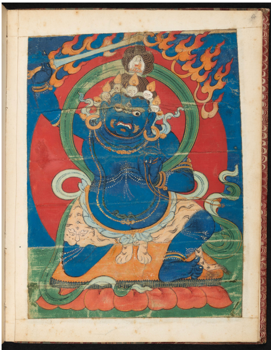
MS Hunter 246.