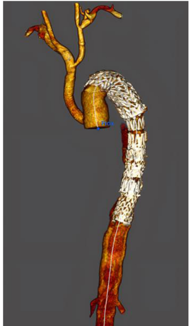
Fig 2. Three-dimensional computed tomography angiogram (CTA) at 6 months of follow-up demonstrating the aortic reconstruction showing the left subclavian to carotid transposition and ascending aortic replacement with reimplantation of the innominate artery by a bypass graft.

According to a US population-based health care database, the incidence of AD during pregnancy and the puerperium has increased from 2002 to 2017 and has been reflected directly by the increase in the incidence of TBAD during pregnancy and the puerperium. More than one-half (58.8%) of these patients presented with AD during the third trimester. 3 This study found that as many as 21.9% of pregnancy-related ADs were in patients