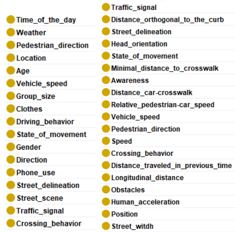
(a) Annotations in JAAD. (b) Annotations used for prediction.