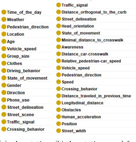
(a) Annotations (b) Annotations used for in JAAD. prediction.