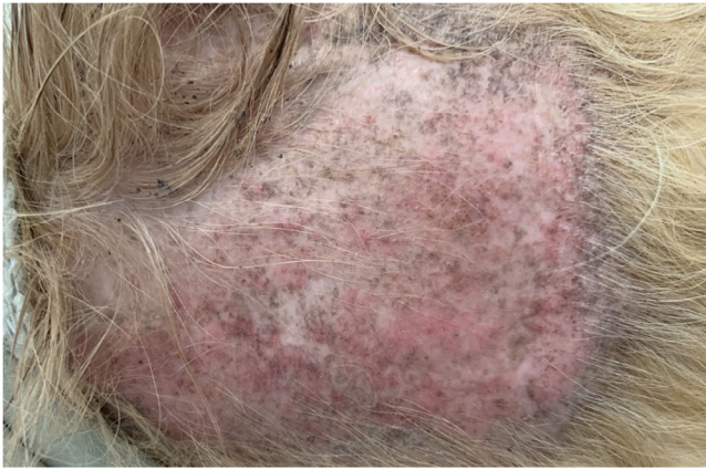
FIGURE 1 Painful flare-up of radiodermatitis: marked erythema and thickness of the skin.

initiated on the site of a surgical skin flap in the dorsal region following removal of a liposarcoma. The protocol used was 12 sessions, three per week at a dose of 3 Gy each for a total of 36 Gy, using 9 MeV electrons with a 0.7 cm bolus on a 15 × 15 cm field. In the medical history, the onset of an acute radiation dermatitis with oedema, ulceration estimated at grade 3 (according to the VRTOG acute radiation morbidity scoring scheme) was reported 1 day after the last RT session. 4 Complete healing of the acute RD was observed 3 weeks after treatment with colloid dressings and systemic antibiotherapy.