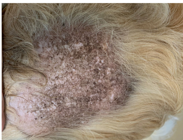
FIGURE 3 Reduced erythema and skin thickness.

erythematosus), skin disorders (such as atopic dermatitis), genetic factors like DNA repair deficiency and personal factors like age, chronic sun exposure, and so forth. 6,8,9 This dog had several intrinsic risk factors, including the target of the RT just below the skin graft and being an atopic dog. The influence of previous sun exposure of the graft cannot be excluded as it was a water rescue dog.