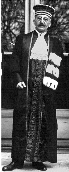
Paul Moriaud, président du Tribunal arbitral mixte germano-belge, le 7 janvier 1924. Détail d'une photographie de l'agence de presse Meurisse. Source: gallica.bnf.fr / Bibliothèque nationale de France.