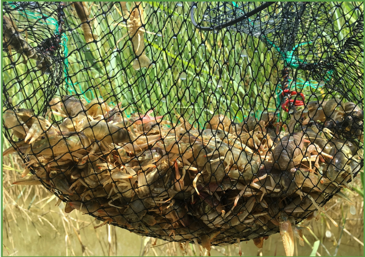
Figure 15. Newly settled alien invasive species are major threats for wetlands and local biodiversity. Here calico crayfish Faxonius immunis (Hagen, 1870) (originated from North America) captured in Emys-targeting traps, Woerr study site, Lauterbourg, France.

disseminate a guide of best practices at local, regional, national and community levels for promoting the effectiveness and upscale conservation actions with similar current and forthcoming projects throughout Europe (Fig. 14).