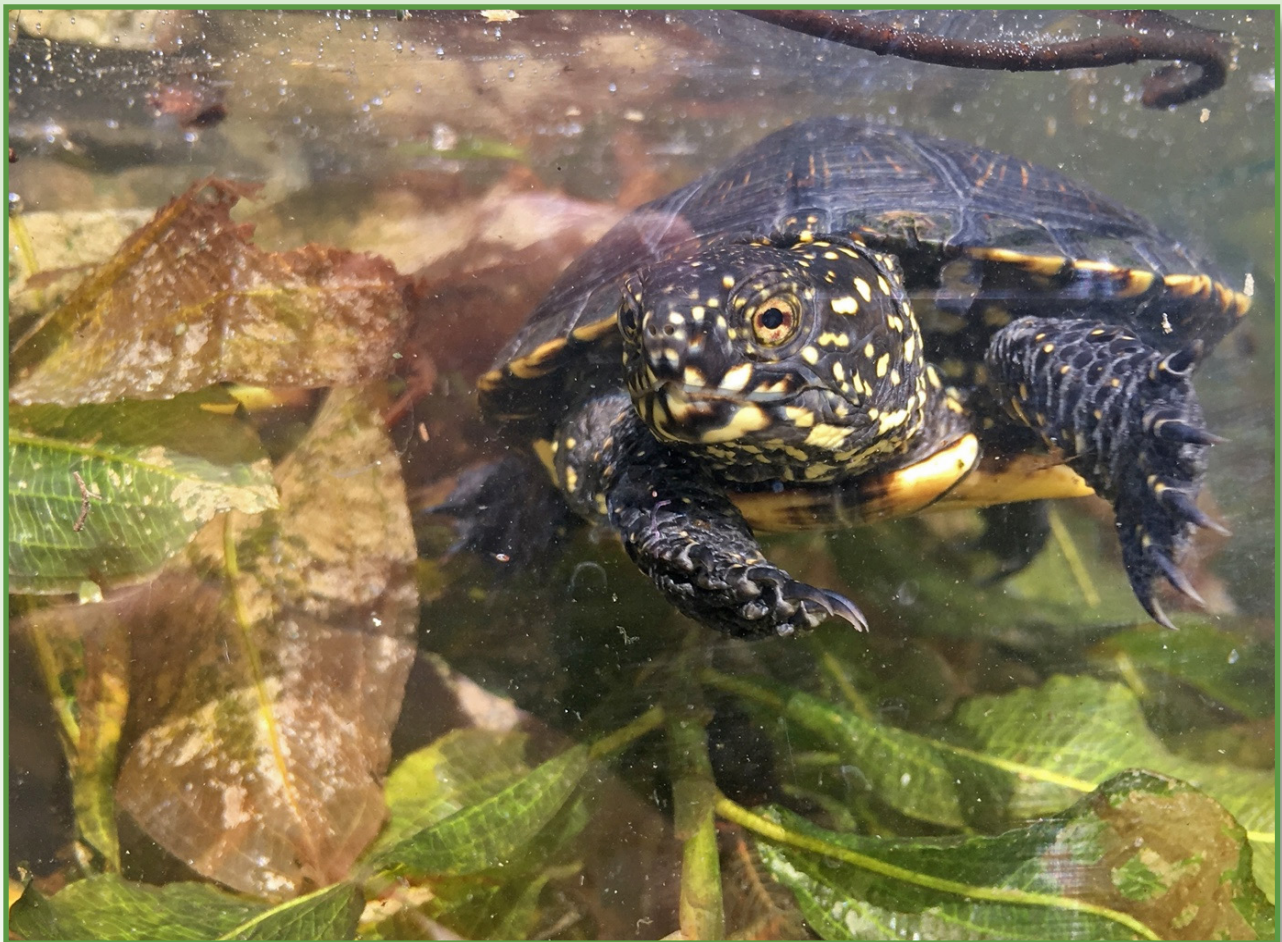
Figure 3. The European pond turtle Emys orbicularis is an emblematic inhabitant of wetlands with positive public perception that may contribute bringing together people and nature.

The European pond turtle Emys orbicularis (Linnaeus, 1758) (hereafter referred as Emys , Fig. 2) is a prominent example of biodiversity loss related to wetland mismanagement. This small-sized freshwater turtle is emblematic of Europe's wetlands and has suffered the most dramatic decline of all reptiles in the continent. Its current European distribution (from Spain to Latvia) is much more restricted than its historical range,