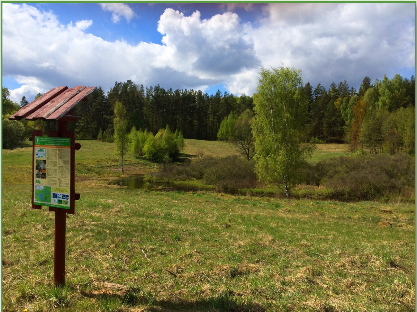
Figure 19. Information boards highlighting conservation initiatives in the release sites are cost-efficient tools for long-term public awareness. Here in Silene study site, Latvia.