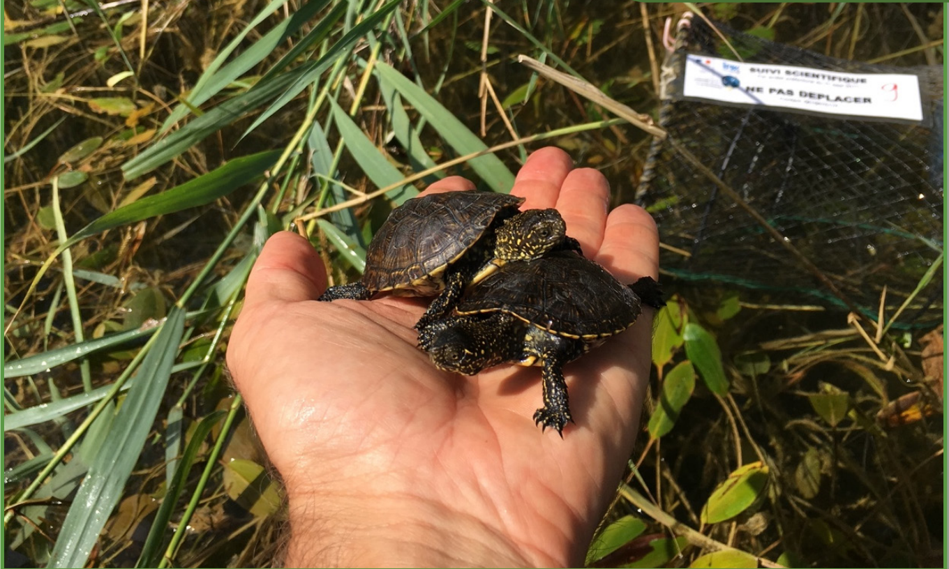
Figure 6. Reproduction in the wild is a major – yet not sufficient – step for a successful reintroduction. Here, two wild-born Emys captured (trap in the background) on the Woerr study site, Lauterbourg, France.

Researchers will assess the functioning of the ecosystem after Emys reintroduction by reconstructing the trophic food web centred around the Emys using environmental genomics. Then, the actual behaviour and habitat use of free-ranging Emys is monitored by deploying ultra-miniaturized autonomous recorders on adults. Furthermore, a multi-scale, multi-species approach focusing on non-target species is implemented by three PhD candidates. The research will be conducted on host-parasite interactions in amphibians and reptiles (Iuri Petrovs) and eels (Alberts Garkajs). Finally, populations of threatened amphibians and invasive crayfish (Fig. 15) are monitored in the field where experimental ponds have been co-created by land managers and scientists for testing adaptive management. This approach aims to enhance their suitability for Emys and amphibians while preventing invasive crayfish to settle (Fig. 7-14).