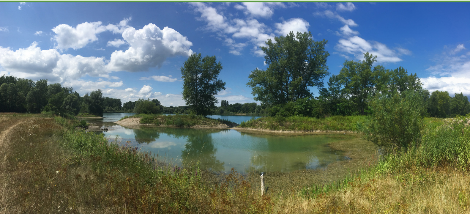
Figure 1. View site Woerr, France.