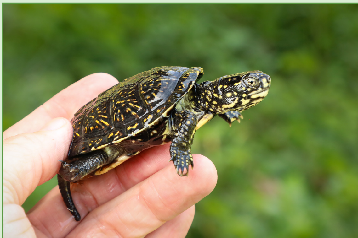
Figure 17. Release of juvenile E. orbicularis .