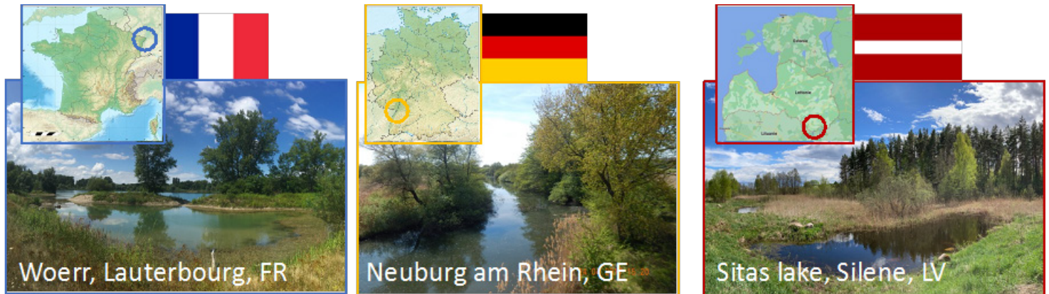
Figure 4. Present geographical distribution of the European pond turtle and location of the three study cases in France, Germany and Latvia where so far 500, 200 and 100 individuals have been introduced in newly created and restored wetlands.

gathering researchers and stakeholders with complementary knowledge and expertise on past, present and future wetlands, biodiversity and management from France, Germany, Latvia, Poland, and Ukraine. One postdoc and six internationally co-supervised PhD candidates collaborating through five complementary work packages run their research based on: