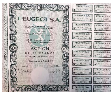
Caption: First listed shared created by Peugeot SA in 1965 75

This new structure corresponds very closely to Alfred Chandler's multidivisional form. It was the outcome of a 100 years of industrial development, during which the level of family coherence resulted in the existence of several companies developing different products, and belonging to different members, but remaining within the same family. Thus, the business could only be decentralized into "autonomous divisions", which were specialized according to product lines. In 1965, each division already had its own management and functional structure and was already operating as an independent company. This highlights the agglomeration of different product lines within a single entity, which was controlled by PSA.