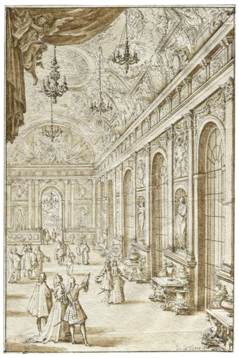
195. Anonymous artist after Sébastien Leclerc, View of the Hall of Mirrors , brown ink on paper, 136 x 91 mm (Versailles, Musée National des Châteaux de Versailles et de Trianon).

is indeed not so far from Leclerc's own. There are two arguments, however, against an attribution to Leclerc. First, the drawing entirely lacks the general effect of the print. In the latter, the distribution of the shadows on the various groups of people produces