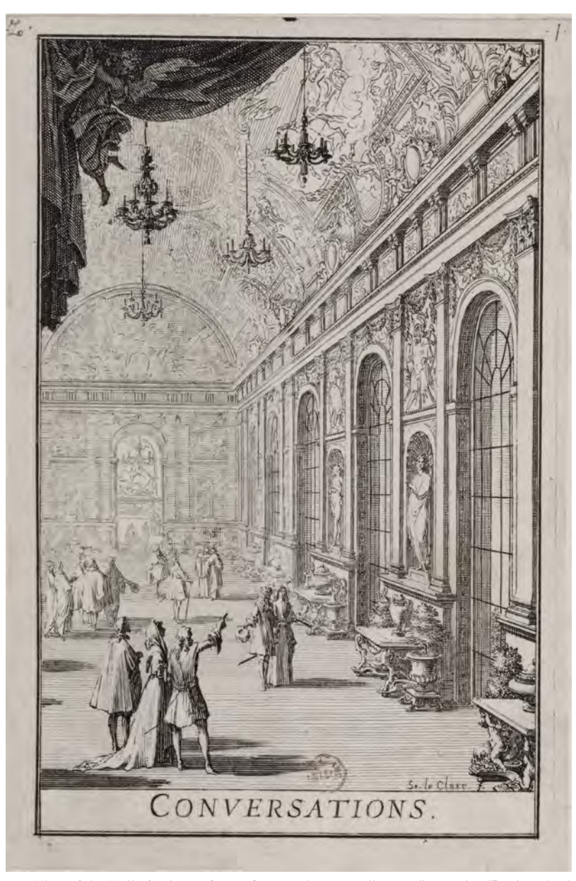
194. Sébastien Leclerc, View of the Hall of Mirrors, from Conversations nouvelles sur divers sujets (Paris, 1684), state 11/1V, etching and engraving, printed borderline 143 x 90 mm (Paris, Bibliothèque Nationale de France).