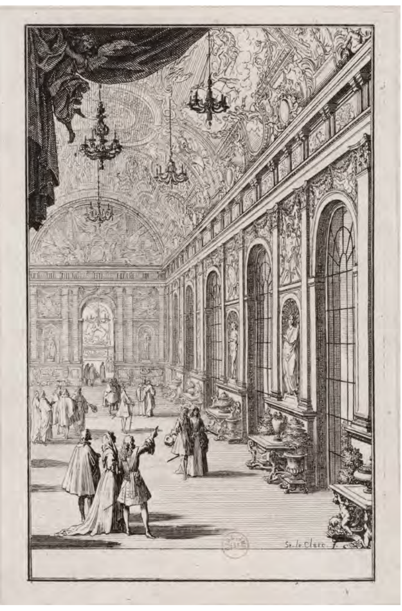
196. Sébastien Leclerc, View of the Hall of Mirrors , state III/IV, etching and engraving, printed borderline 143 x 90 mm (Paris, Bibliothèque Nationale de France).

version of his St Augustine Preaching because the first one was highly sought-after by collectors and had become exceedingly rare, he chose to produce an entirely different composition.<sup>9</sup> It can therefore be assumed