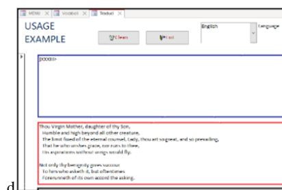
Fig. 5. Example of the digital intelligence W. Tool in NooJ environment.