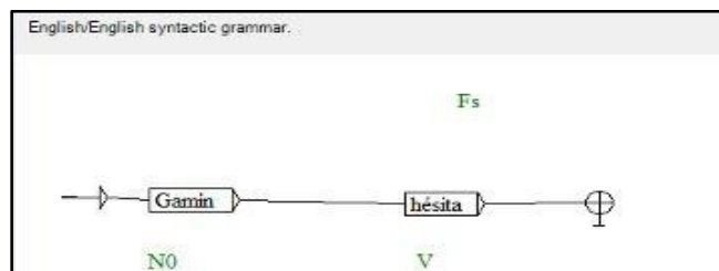
Fig. 3. Analysis and graphs converging in a single local grammar.

(dictionaries of simple and compound words) to which it has been flanked a dictionary electronic specialist in the sector from the communication.