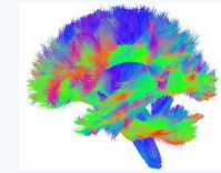
Diffusion Weighted Image (DWI)

13 HC female 25 MS female age \mu \pm \sigma : 44 \pm 12 and 48 \pm 11