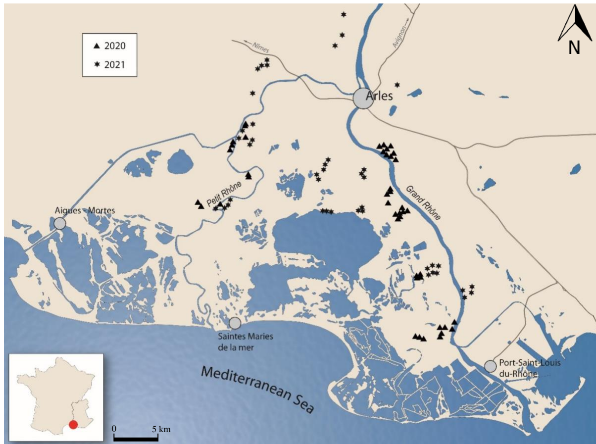
Figure 1 - Location of the 86 crop fields monitored for birds in Camargue, Rhône delta. Triangles represent crop fields sampled in 2020 and stars represent crop fields sampled in 2021.

Finally, to account for the possible confounding effect of crop field heterogeneity, we also estimated within each 500 meter buffer the mean crop field size and the Shannon diversity index of crop types ( \text{Crop\_SHDI} = -\sum_{i=1}^n p_i \ln p_i , where p_i corresponds to the proportion of crop cover type i in the landscape), following the method implemented in Sirami et al. (2019). As a result, we obtained values for eight landscape variables for each sampled crop field.