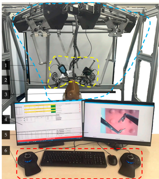
Mobile platform (detailed view)