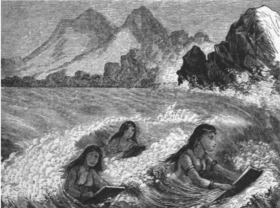
Figure 3. Twain, Mark, "Surf Bathing Failure," 1865, Roughing It , public domain.