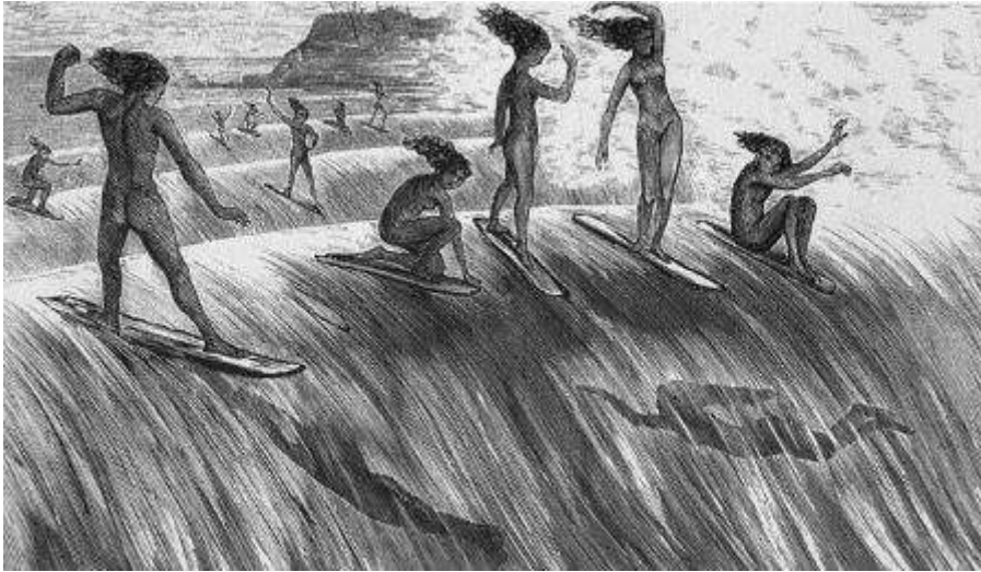
Figure 1. Unknown, Early Hawaiian Surfriders , Late 18 th Century

mistakenly repeated in graphics through the latter part of the nineteenth century and sometimes into the present.