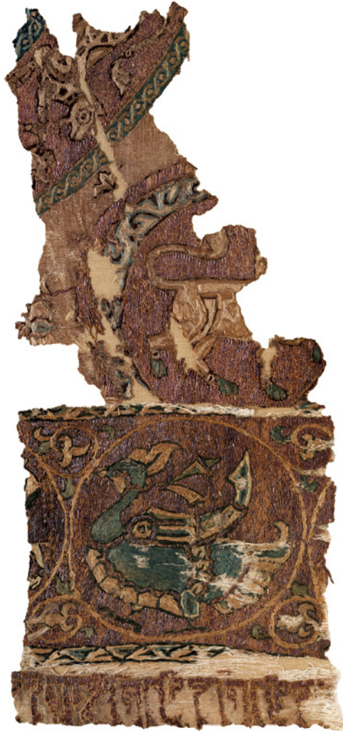
FIGURE 4 A fragment of the Beast Cloth (1952.257) CLEVELAND MUSEUM OF ART, CLEVELAND