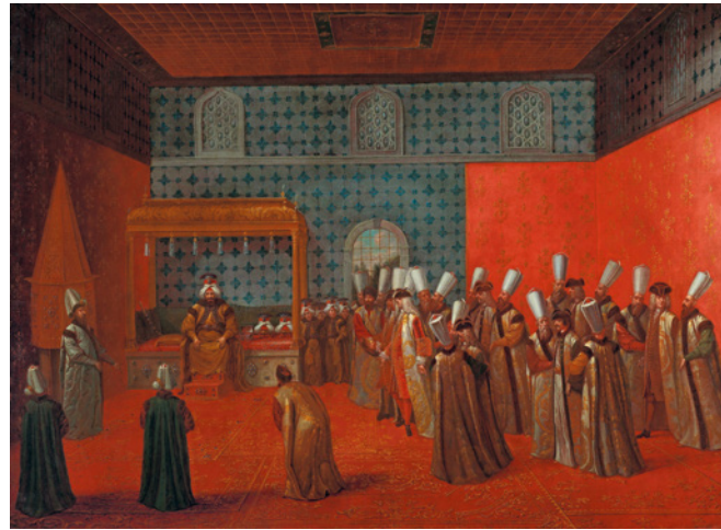
FIGURE 22 Jean Baptiste Vanmour, Audience of Sultan Ahmed III , c.1139/1727 RIJKSMUSEUM, AMSTERDAM

brought by the advent of the Mongols. 11 In the tenth/sixteenth century, the practice re-emerged with impetus when the courts of Mehmet II and his Ottoman successors, rescuing many aspects of the ‘Abbasid ceremonial vocabulary, decorated once more their Chamber of Petitions in Topkapi with lavish textiles woven with gold meant to “dazzle the eyes” (Necipoğlu, 1991: pp. 96–110) (Fig. 22).