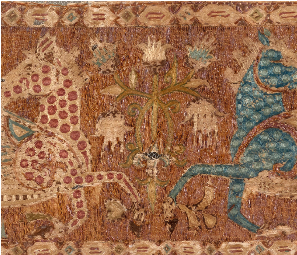
FIGURE 7 The Pegasus Cloth (detail), the Textile Museum Collection, Washington DC

was added over a linen tabby sewn with coloured silk and gilt membrane thread (Alonso Benito, 2009: p. 409). The decorative scheme on the surface repeats the programme of roundels united by pearly interlaced borders. Each of the 20 cm roundels contains representations of eagles, elephants, gryphons, horses, human figures, and peacocks following our texts. The rims are also decorated with large inscriptions.