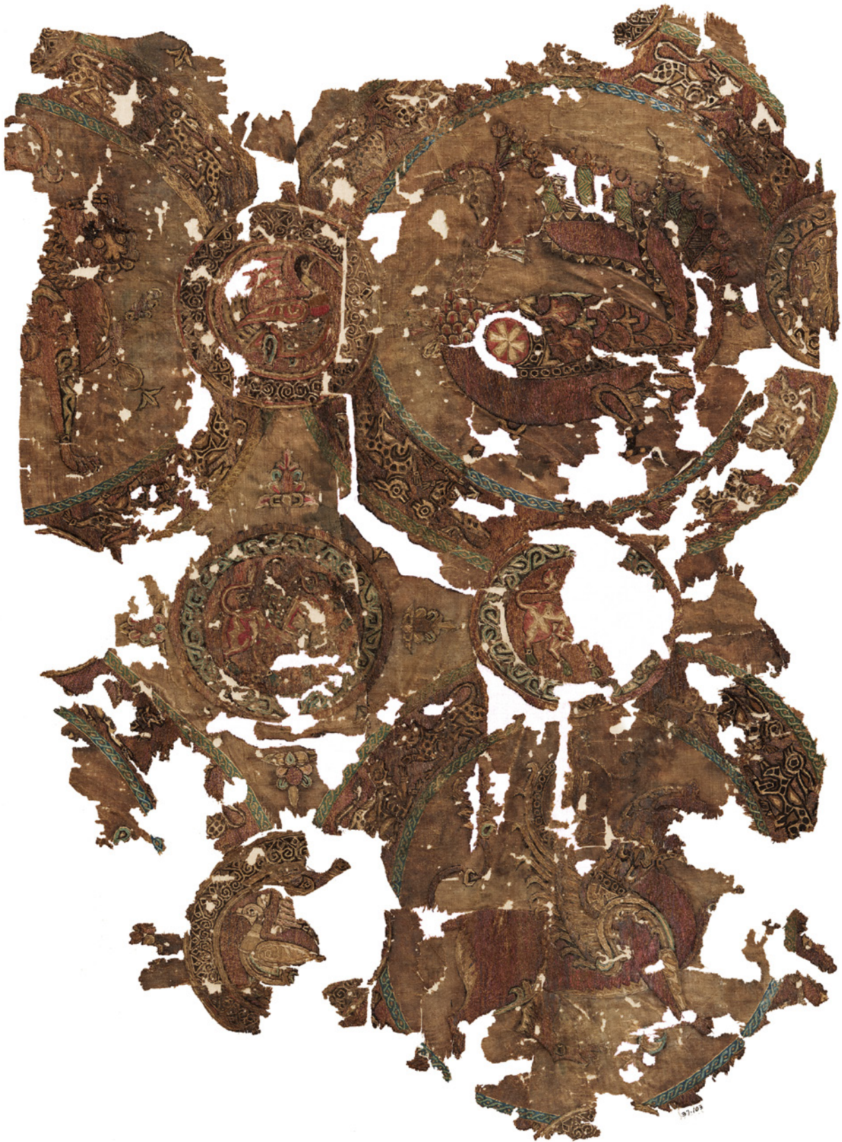
FIGURE 3 Fragments of the Beast Cloth (37.103) MUSEUM OF FINE ARTS, BOSTON