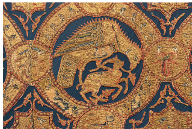
FIGURE 17 A digital reconstruction of the blue silk ground in the Chasuble of Fermo