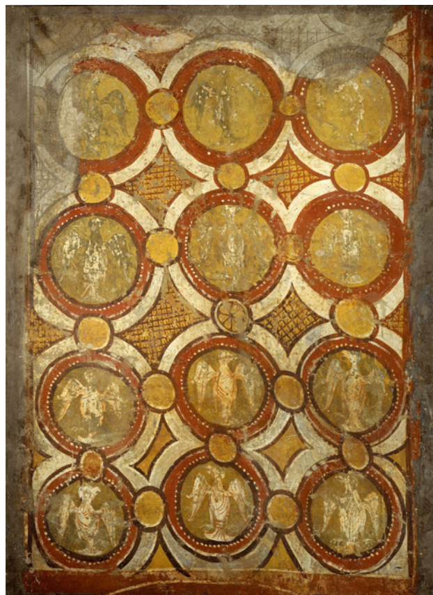
FIGURE 21 A decorative panel (57.97.6) from the hermitage of San Baudelio de Berlanga, Castile and León, inspired by the textile tradition (possibly 523–8/1129–34)