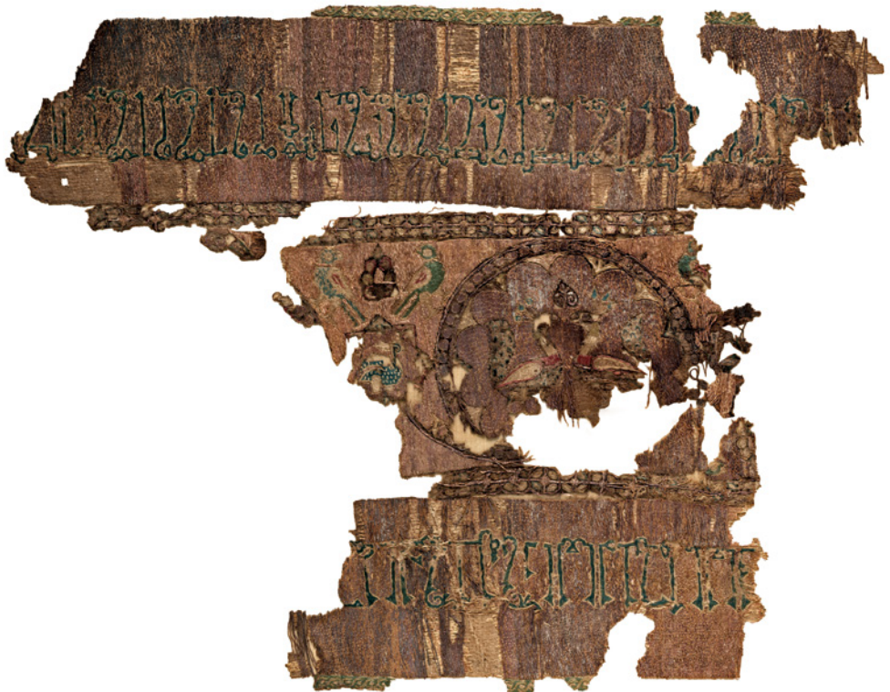
FIGURE 5 A textile fragment embroidered with metallic thread and silk (1938.300) CLEVELAND MUSEUM OF ART, CLEVELAND