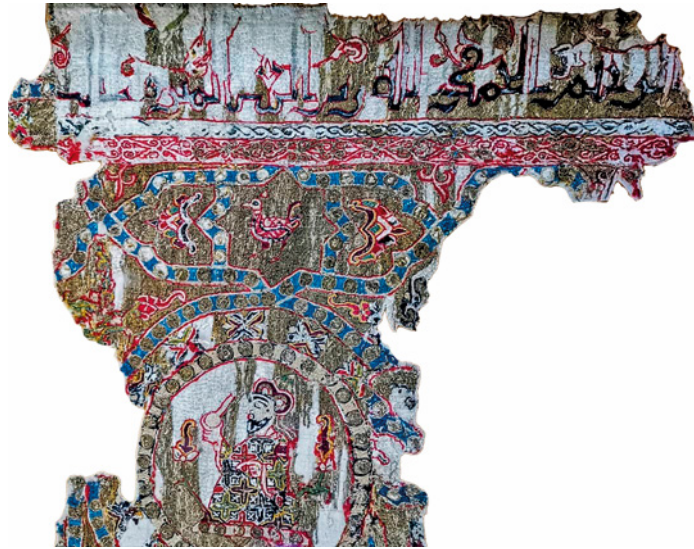
FIGURE 8 A fragment from the Tela de Oña