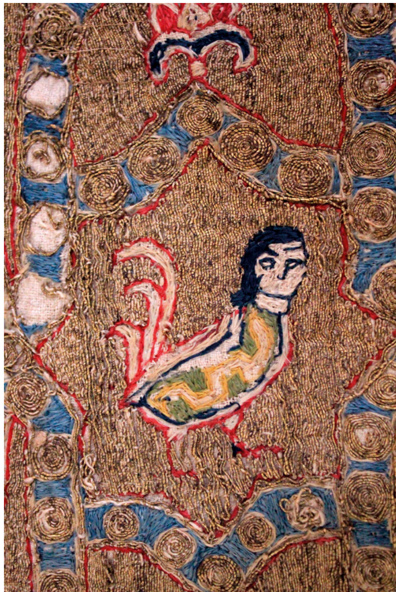
FIGURE 9 Tela de Oña (detail)