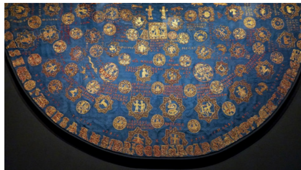
FIGURE 16 Sternemantel of Heinrich II, gold thread on blue silk damask, c.411/1020, Diocesan Museum, Bamberg

During this time, we can also find gold-threaded astrological cloths fabricated in Byzantium and the Near East, such as the Sternenmantel (c.411/1020) in Bamberg (Woodfin, 2008: pp. 36–7; Anderson, 2017: p. 52) (Fig. 16). Any narrative or astrological relation to the iconography in the textiles we have analysed, as Simon-Cahn (1993: p. 3) proposed, is questionable and refuted by Shalem (2017: p. 101). Their similar and repetitive themes appear to be the embodiment and metaphor of the very creatures associated with beauty, power, and sovereignty constellated around the figure of the king, rather than astrological symbols. Yet textiles with blue backgrounds – including those from Fermo (Fig. 17) and Autun – and architecture, namely the carvings in the Convent