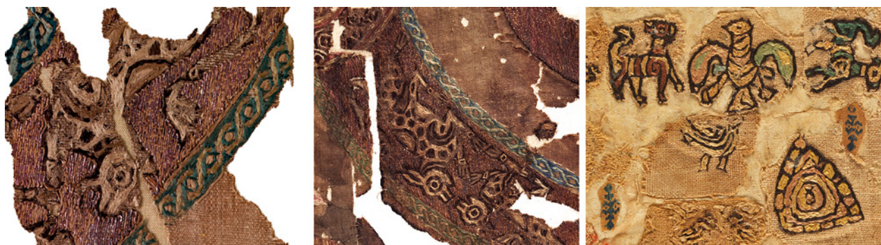
FIGURE 14 Beast Cloth detail (left and centre), silk on linen embroidery from Egypt, detail (right), (1971-50-23) COOPER HEWITT MUSEUM, NEW YORK