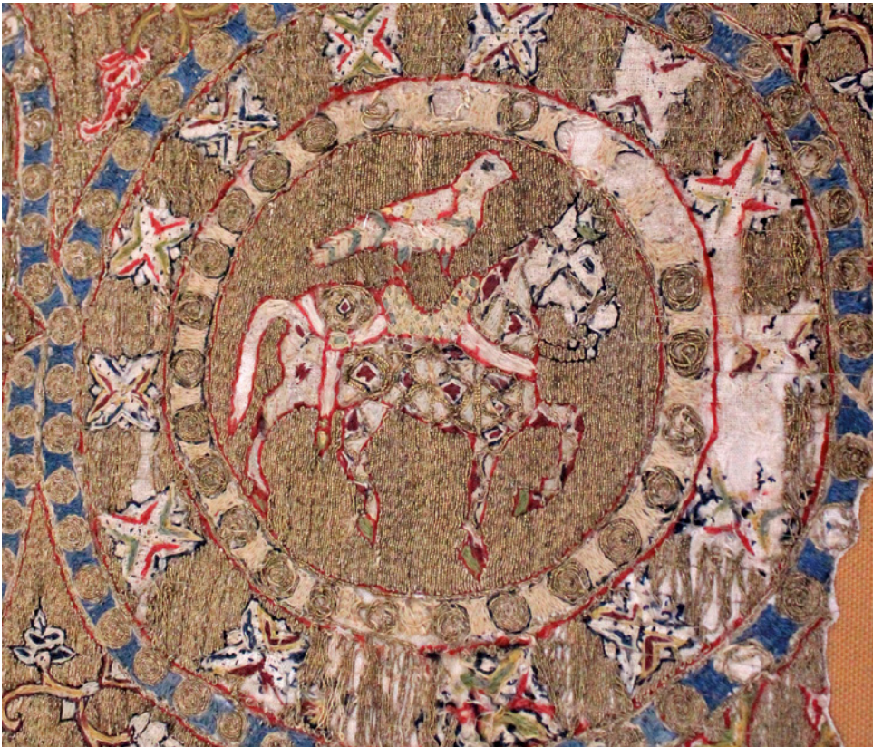
FIGURE 10 Tela de Oña (detail), Horse and Goshawk

still supported by Ali-de-Unzaga (2017: pp. 115–7), who recognises the seated figure in one of the roundels as a representation of this caliph and dates it to the end of the fourth/tenth century (Fig. 8). Makariou (2001: pp. 47–60), on the other hand, argues that it was commissioned by Malik al-Muẓaffar (r. 392–8/1002–8), the de facto ruler of Cordoba and one of the sons of al-Manṣūr. However, both arguments appear unsubstantiated. 2