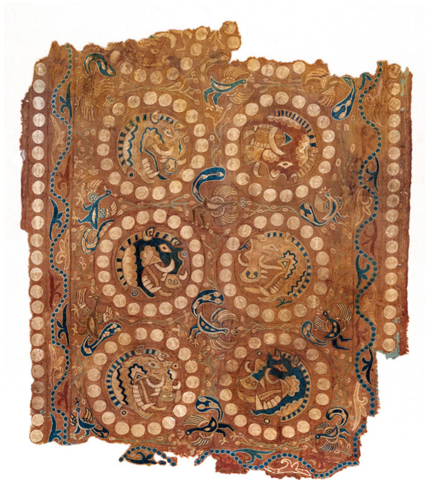
FIGURE 13 A Sasanian or Sogdian silk embroidery on plain-weave silk (2004.260), first/seventh century METROPOLITAN MUSEUM OF ART, NEW YORK

esteem for Eastern Mediterranean and Iranian fabrics over Andalusí textiles in court environments during the fourth–fifth/tenth–eleventh centuries. Although this discussion should remain content for another publication, the hypothesis is corroborated by additional observations: