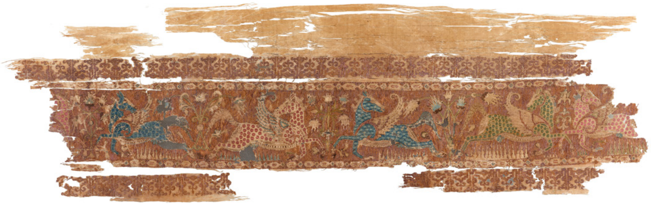
FIGURE 6 The Pegasus Cloth (73.276), the Textile Museum Collection, Washington DC