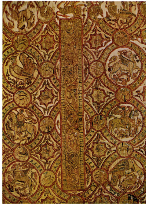
FIGURE 11 Detail from the Chasuble of Fermo , Fermo Cathedral, Marche AFTER SANTANGELO, 1960: P. 275

is renowned as the earliest embroidered textile of this type fully dated and localised. A monumental oblong panel contains a sizeable Kufic inscription translated by Rice in 1959 bearing the year 510/1116 and locating it in “Mariyya” or Almeria (Simon-Cahn, 1993: p. 1; Shalem, 2017: pp. 55–60). Nonetheless, Shalem (2014b; 2017: pp. 63–5) has noted that a reliable reading cannot be obtained given the poor condition of the inscription.