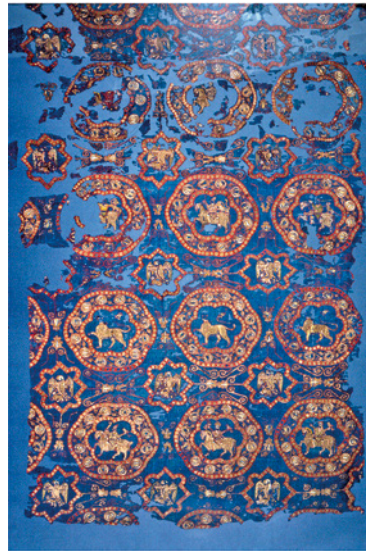
FIGURE 12 Suaire de Saint Lazare

inscriptions quoting glory and power found in at least four of the horsemen's belts. Therefore, it is very likely that these texts were not soubriquets but generic benedictions (Dor, 2017: p. 132). More recently, Rosser-Owen (2022: p. 300) attributed this textile to the Taifa 'Amirid court.