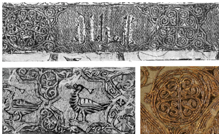
FIGURE 15 The Mitre de San Valero in Roda (top and bottom left), After Floriano, 2006: p. 32. An embroidered textile (29.106a, b), allegedly from Egypt (bottom right)