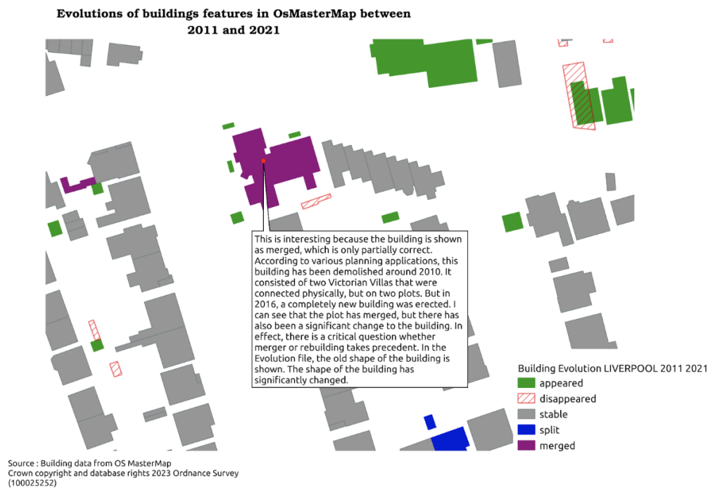
Figure 2. Example of Geospatial User Feedback on the building evolution model, with change detection on OSMasterMap 2011 and 2021 data for Liverpool.

Acknowledgements. This research was performed during the project SUBDENSE funded by the seventh Open Research Area in social sciences (ANR, DFG, ESRC ES/X008290/1).