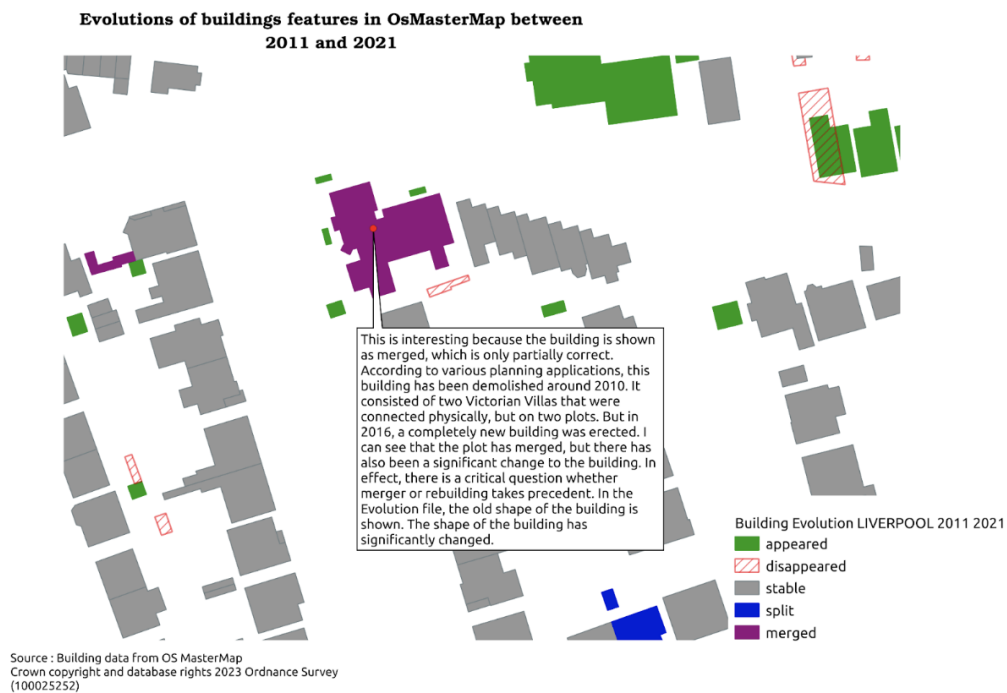
Figure 2. Example of Geospatial User Feedback on the building evolution model, with change detection on OSMasterMap 2011 and 2021 data for Liverpool.

Acknowledgements. This research was performed during the project SUBDENSE funded by the seventh Open Research Area in social sciences (ANR, DFG, ESRC ES/X008290/1).