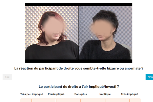
Fig. 1. A Snapshot of a Trial.

They are asked to respond as quickly and accurately as possible. After reading the instructions, participants begin the experiment with a training block containing 11 trials not used in the blocks. The stimuli are separated by 1 second of white screen. The first question appears on the screen 300 ms after the video ends and the second question 300 ms after the participant answers the first question. The experiment is divided into two blocks each containing 32 trials. Blocks are separated by a maximum break of 2 minutes. The order of the blocks remains consistent, while the presentation of stimuli within each block is randomized. At the end of the blocks, we ask them to make comments on the experience if desired and to answer to two questions to find out if they perceived the editing of the videos. The first question is “ Did you feel that some of the videos were buggy? ” and “ Most of the videos you just saw were edited. Did you realize that? ”. The average total duration of the experiment was 18.72 minutes (sd = 3.72, min = 12.81, max = 30.13).