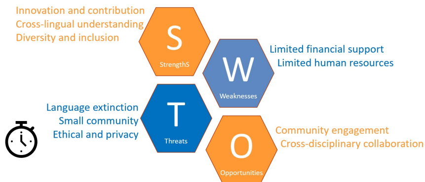
Figure 1. SWOT diagram on working on low-resource languages.

sion, with new researchers being involved like researchers for whom these low resource languages matter.