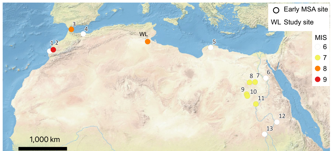
Figure 3. Map of Middle Pleistocene MSA contexts with chronometric estimates in North Africa (WL stands for Wadi Lazalim, the sites here discussed): 1, Bizmoune; 2, Jebel Irhoud; 3, Benzù; 4, Ifri n'Ammar; 5, Haua Fteah; 6, Taramsa 1; 7, Kharga; 8, Dakhla; 9, Bir Tarfawi; 10, Bir Sahara; 11, Sai 8-B-11; 12, EDAR 135; 13, Al Jamrab. Marine Isotopic Stage (MIS) of earliest estimated occupation is also indicated for each site (map created using QGIS 3.20.2 https://qgis.org/it/site/ ; base map made with Natural Earth).

Along with the above types, the site also contained one tanged tool made on a thick cortical flake from layer 5 (Fig. 2 n. 12, length = 53 mm, width = 32 mm, thickness = 4 mm), and two backed pieces from layer 4b (Fig. 2 n. 13, length = 36 mm, width = 19 mm, thickness = 13 mm) and layer 4a (Fig. 2 n. 14, length = 37 mm, width = 19 mm, thickness = 7 mm).